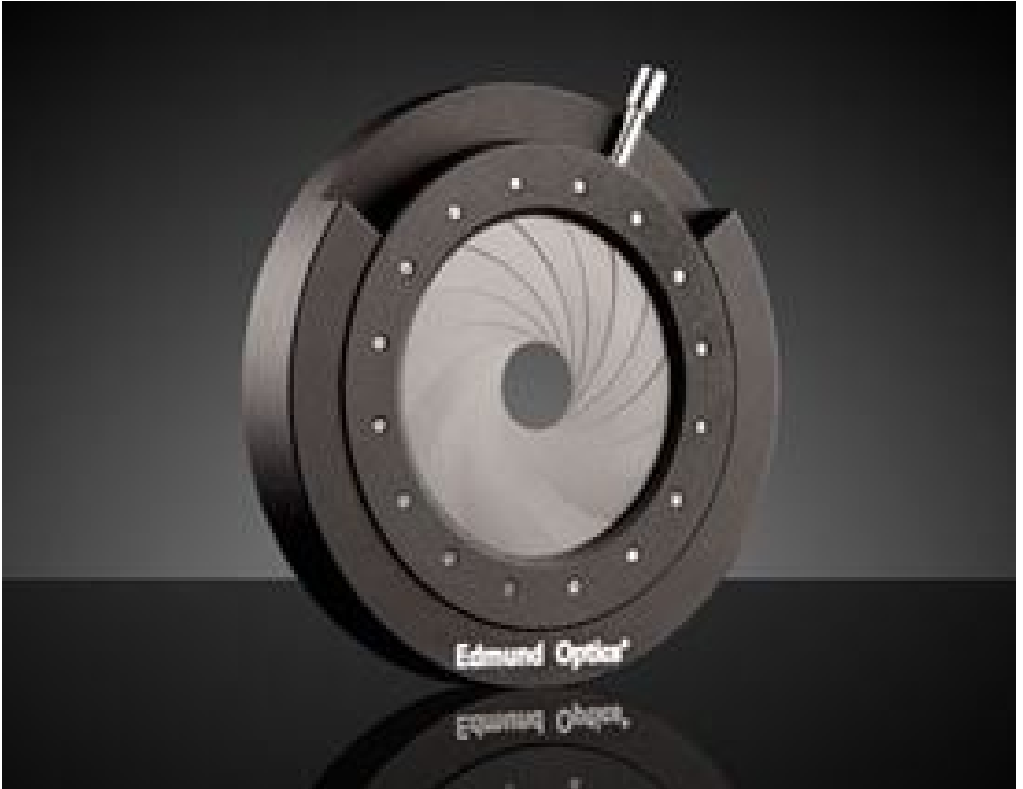
66mm Outer Diameter, Mounted Iris Diaphragm, #53-916