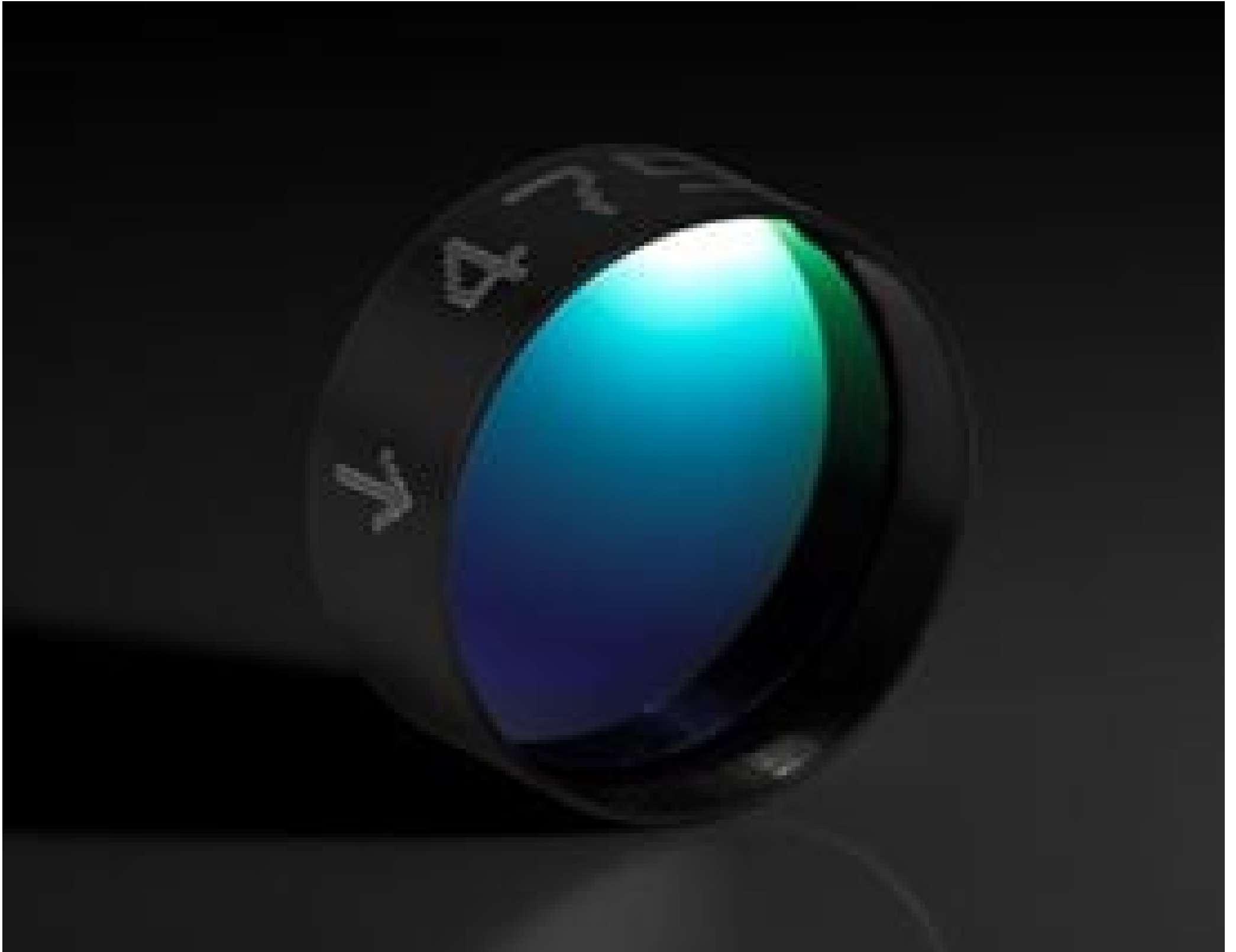
12.5mm Dia. OD8 High Blocking Bandpass Filter