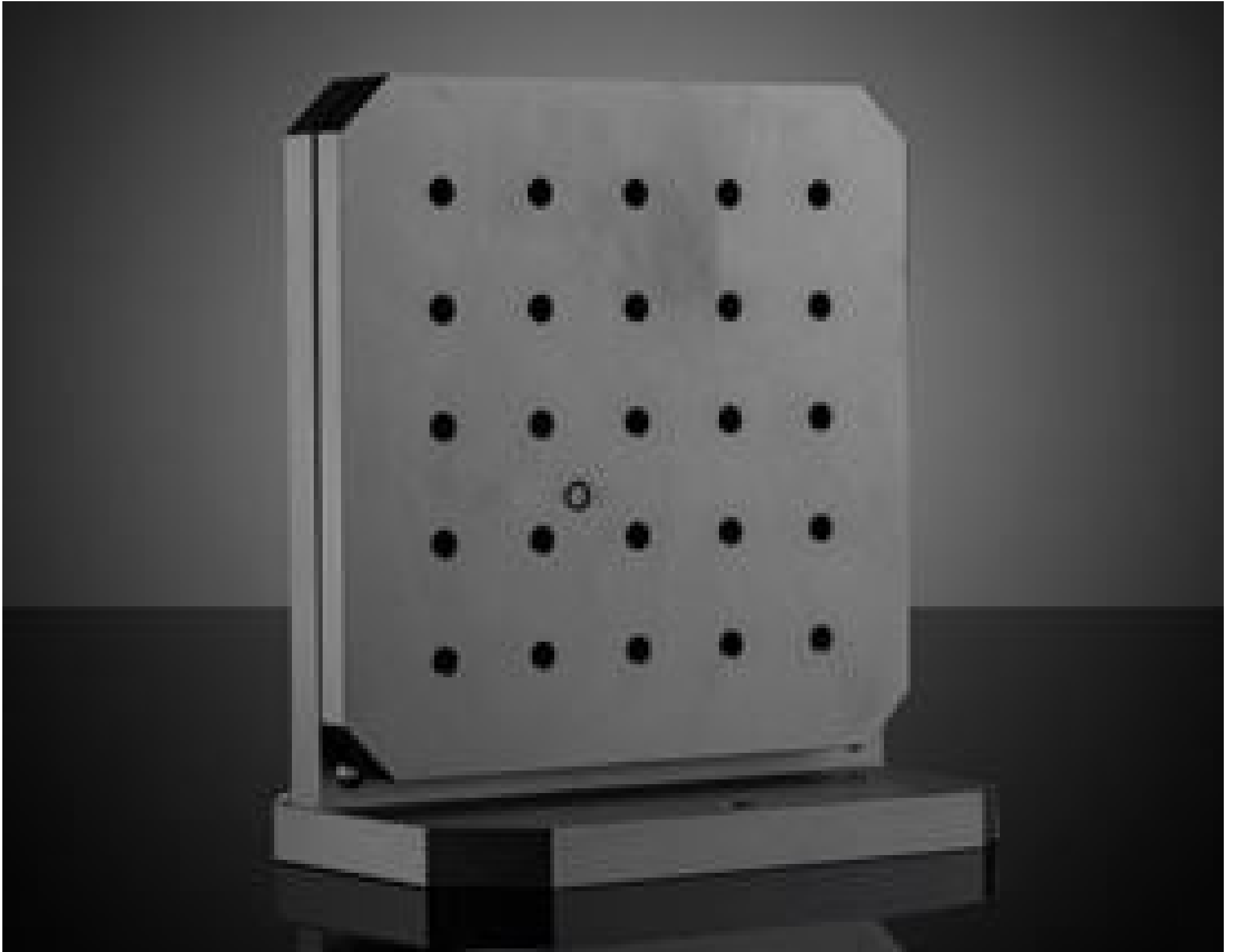
6.0" Angle Mirror Mount