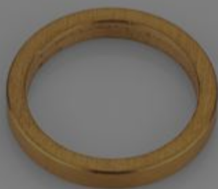
#03-631 - 0.5mm Thick, C-Mount Brass Spacer Ring €11,25