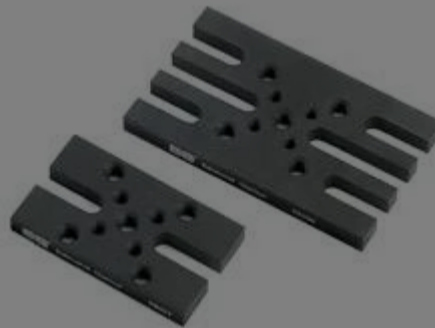
Threaded Base Plates