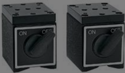
English and Metric Magnetic Bases