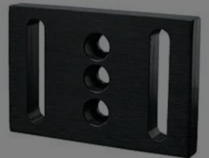
Slotted 2" x 3" Base Plates