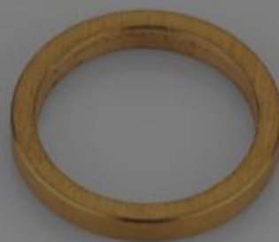
#03-632 - 1.0mm Thick, C-Mount Brass Spacer Ring €11,25