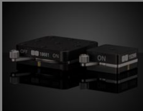
Low Profile Magnetic Bases