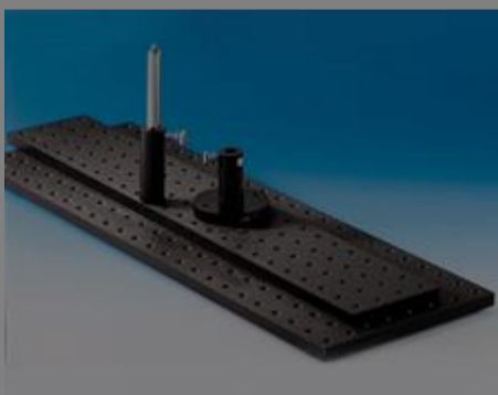
#03-640 - 24" x 12", Breadboard €387,00