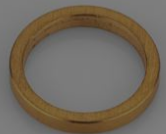
#03-633 - 2.0mm Thick, C-Mount Brass Spacer Ring €11,25