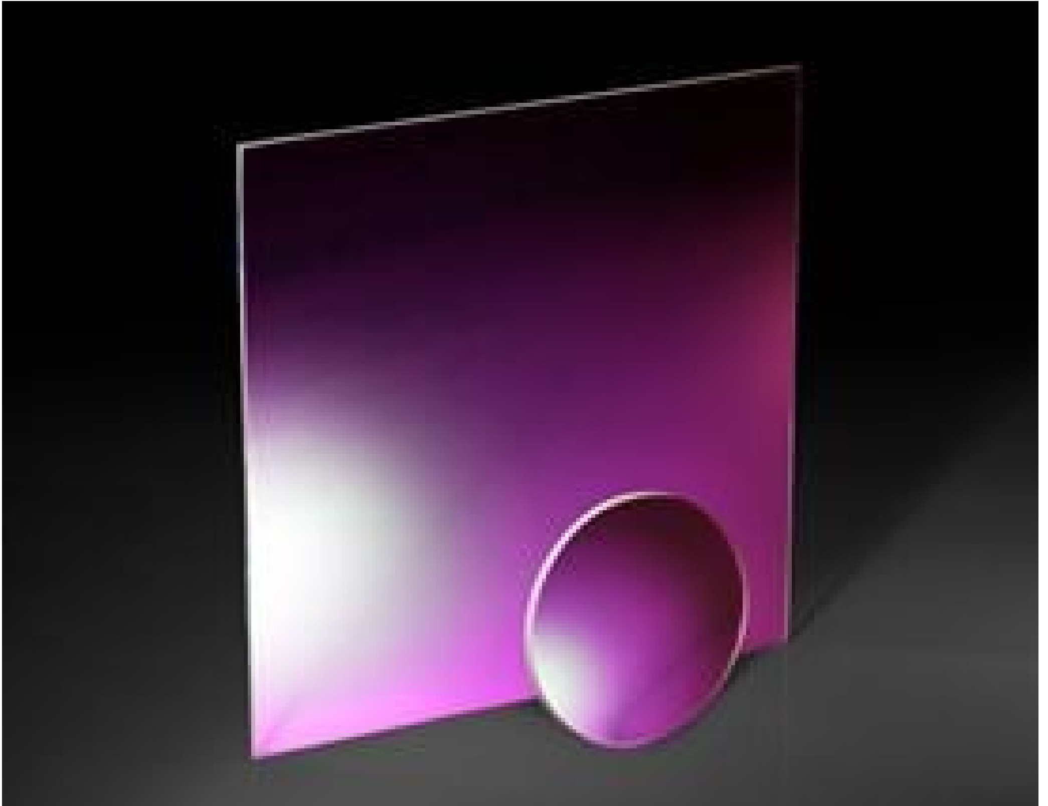
EAGLE XG® Windows