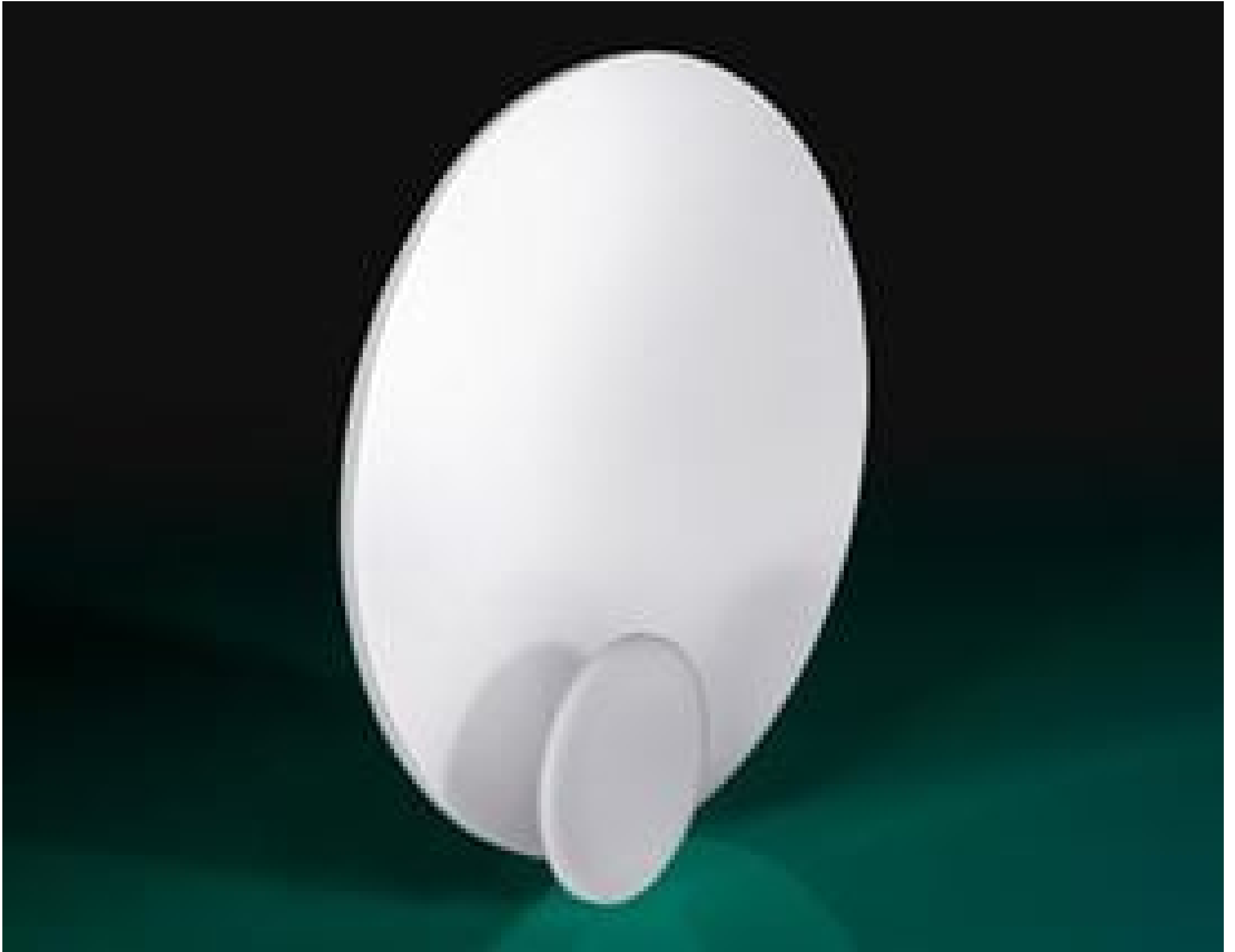
White Diffusing Glass