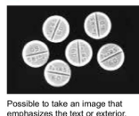
Possible to take an image that emphasizes the text or exterior.