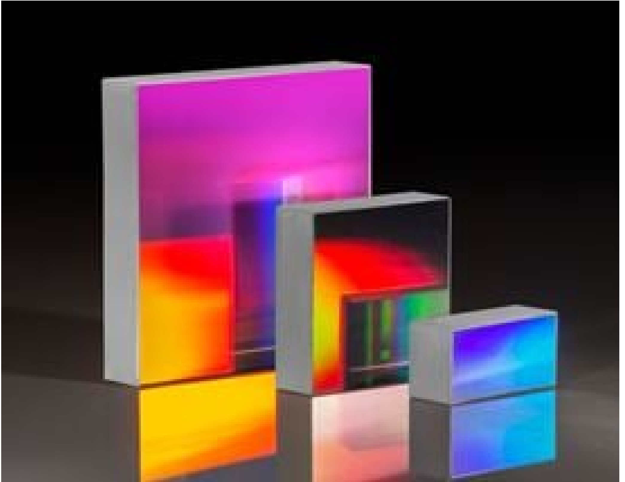
Reflective Ruled Diffraction Gratings