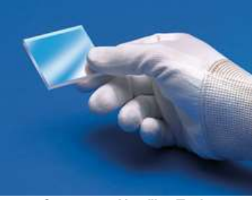
Component Handling Tools

These optics require special handling to avoid damage and ensure long-term performance. Proper handling, cleaning, and storage are essential to maintain optical quality. Explore our Optics Cleaning Resources for step-by-step guides and best practices. For personalized assistance, Email us or Chat with our technical support team.