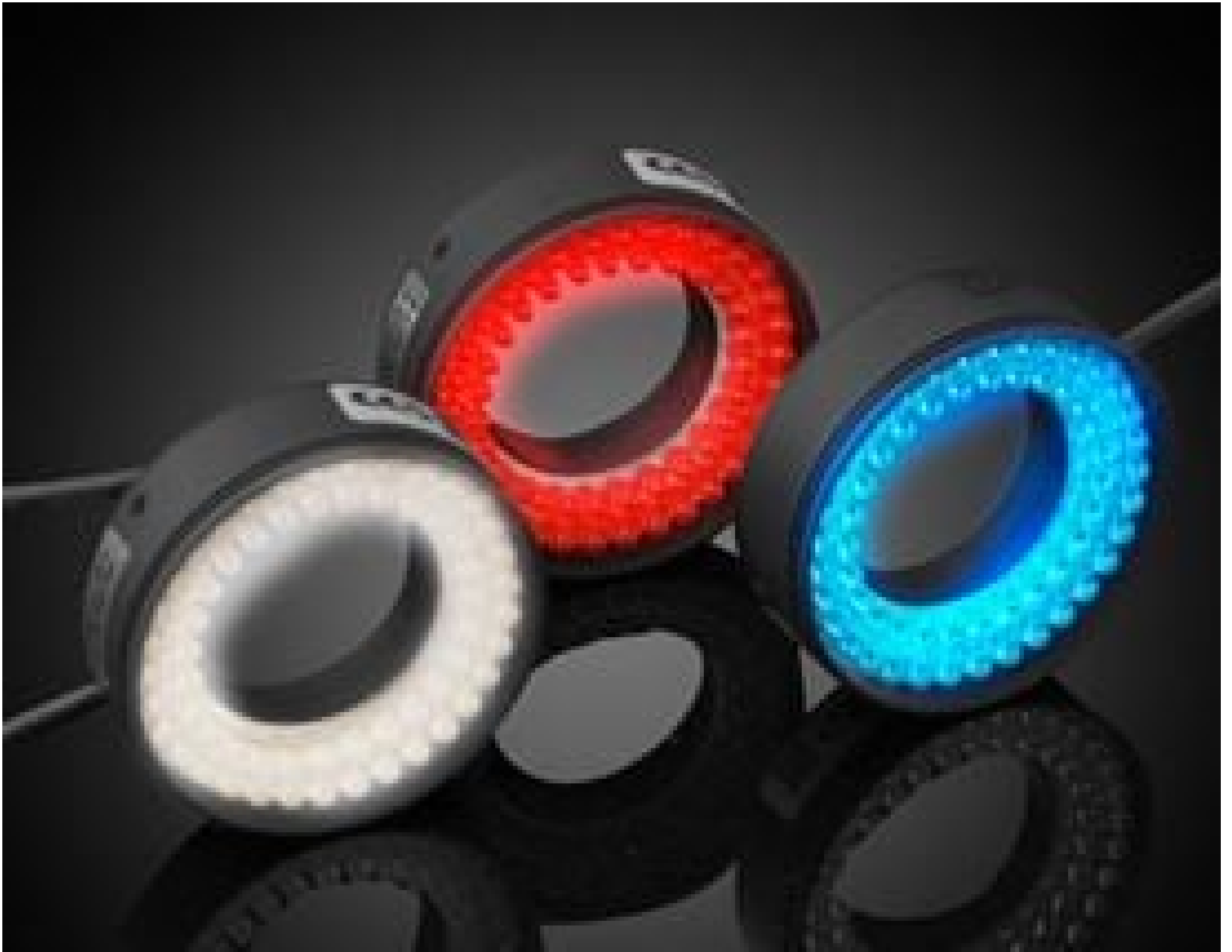
CCS High-Angle LED Ring Lights