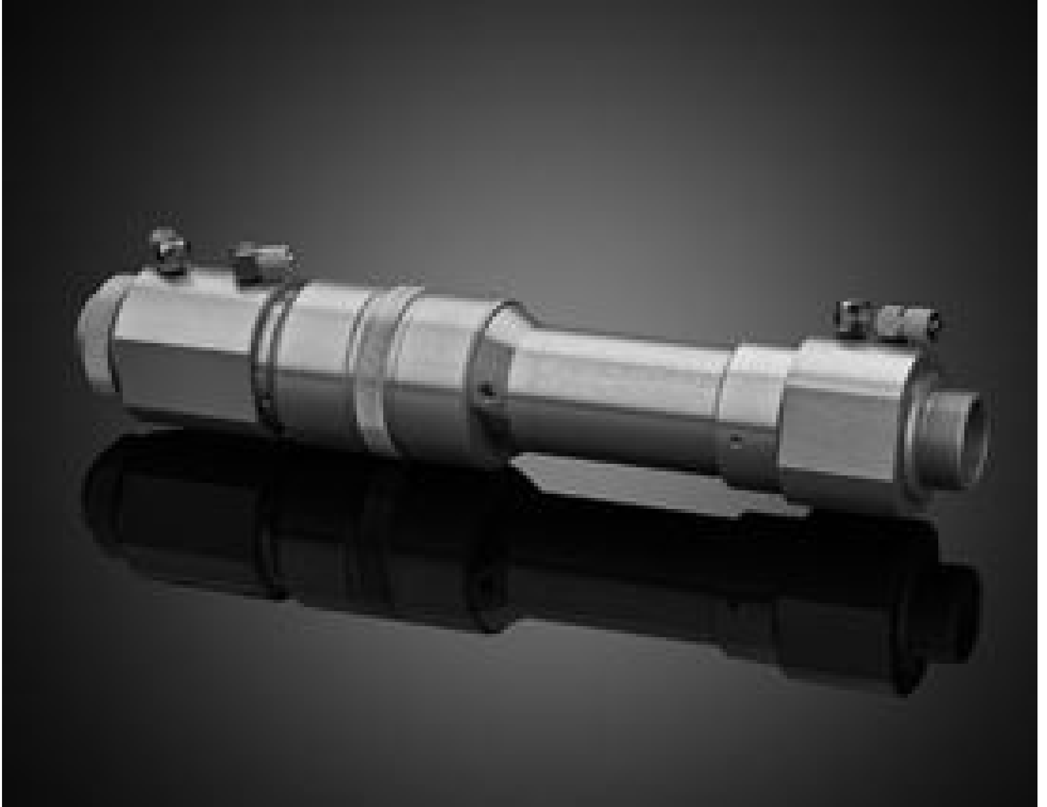
#25-839: 9.4µm Flat Top Beam Shaper | πShaper 12_12_9.4