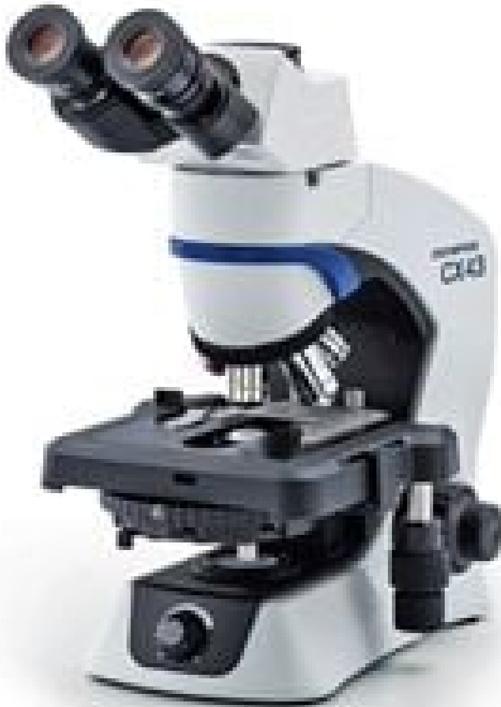
Image shown is full assembly. Each component sold separately. See Technical Information tab for additional details.