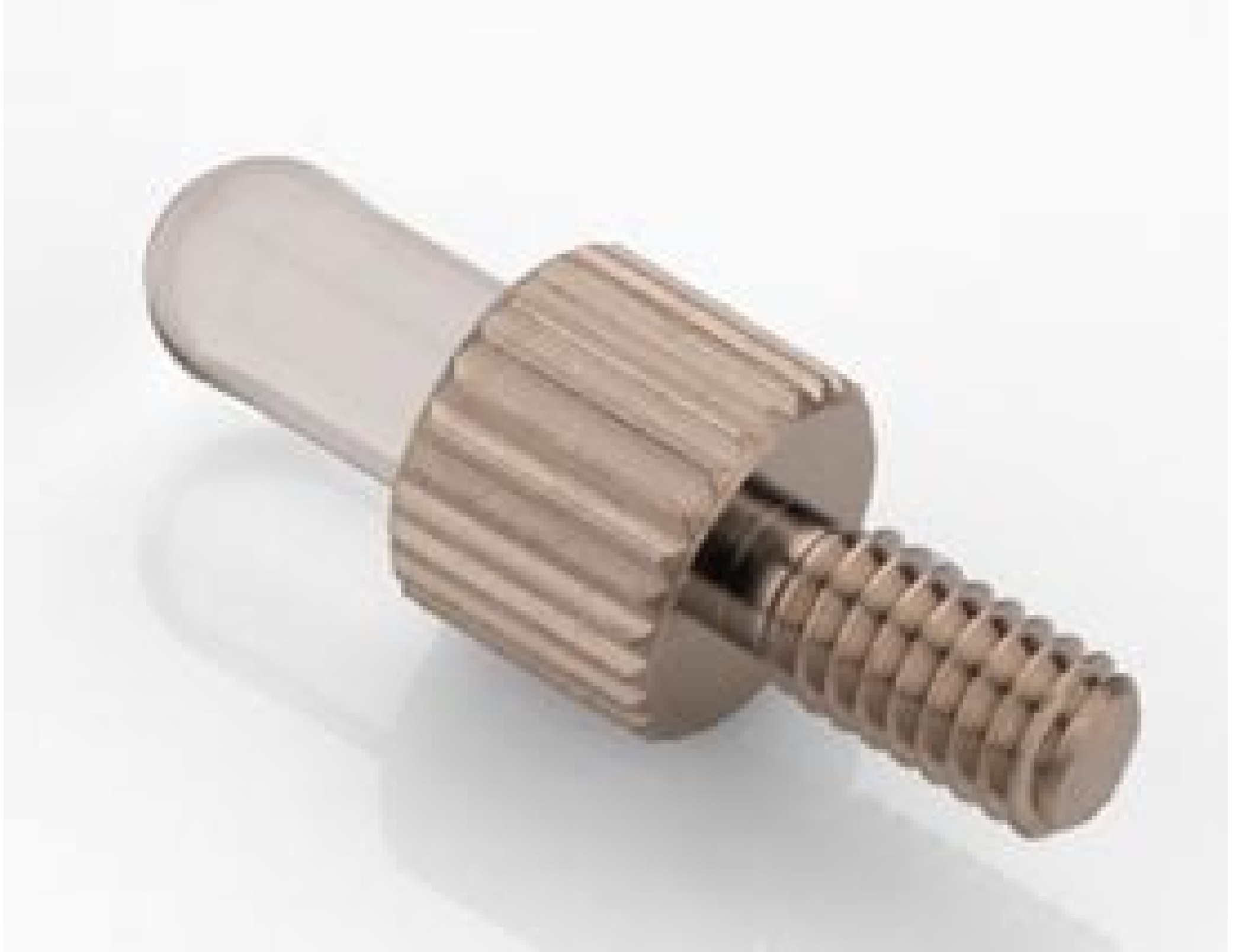
Plastic Attachment Measuring Probe