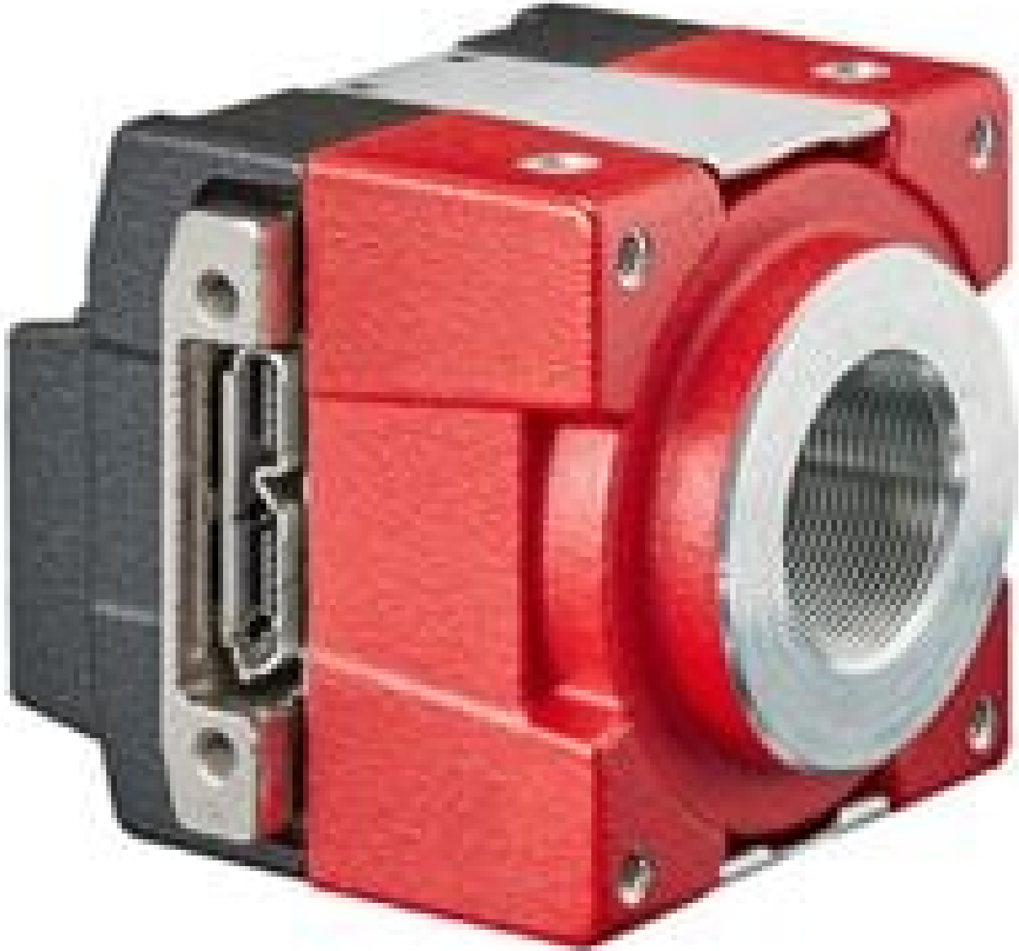
Allied Vision Alvium Camera, Full Housing, S-Mount, Right Angle IO Port (Front)