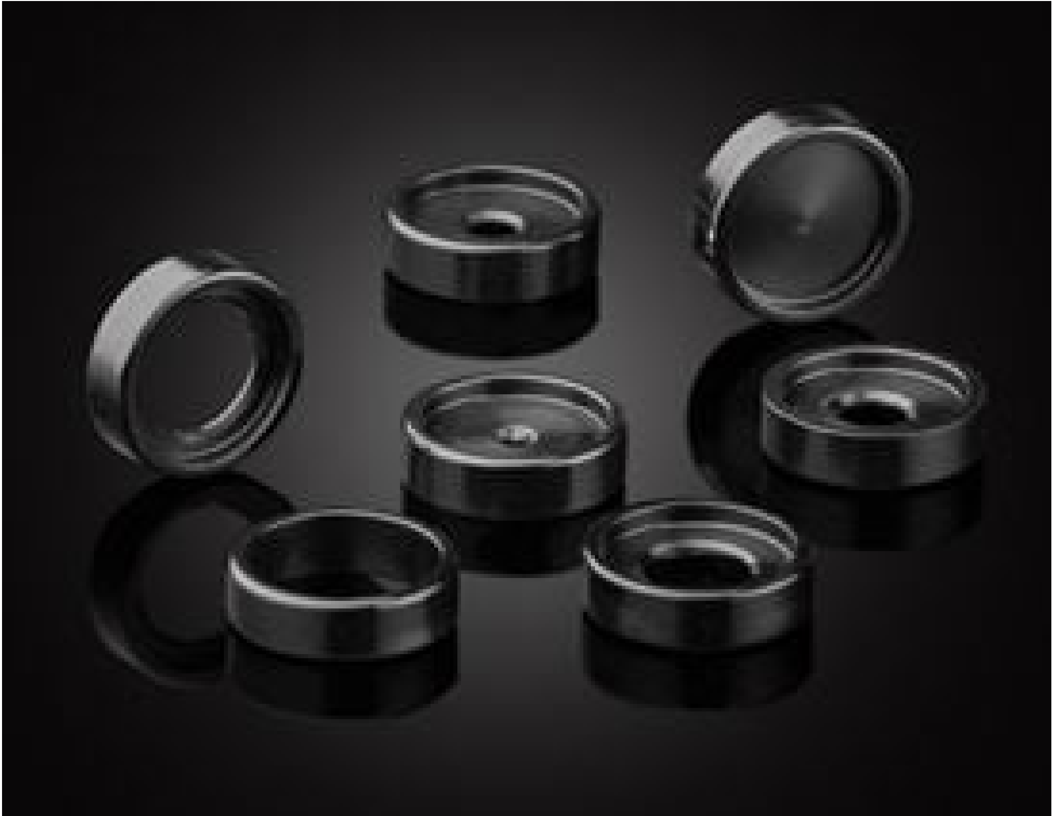
Aperture Kit for Achromat Prototyping Kit