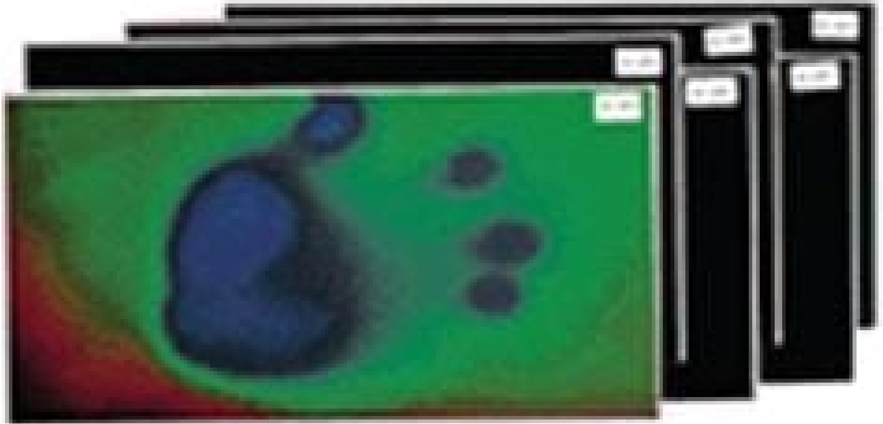
Temperature Sensitive Liquid Crystal Sheets