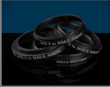
Machine Vision Filter Adapters