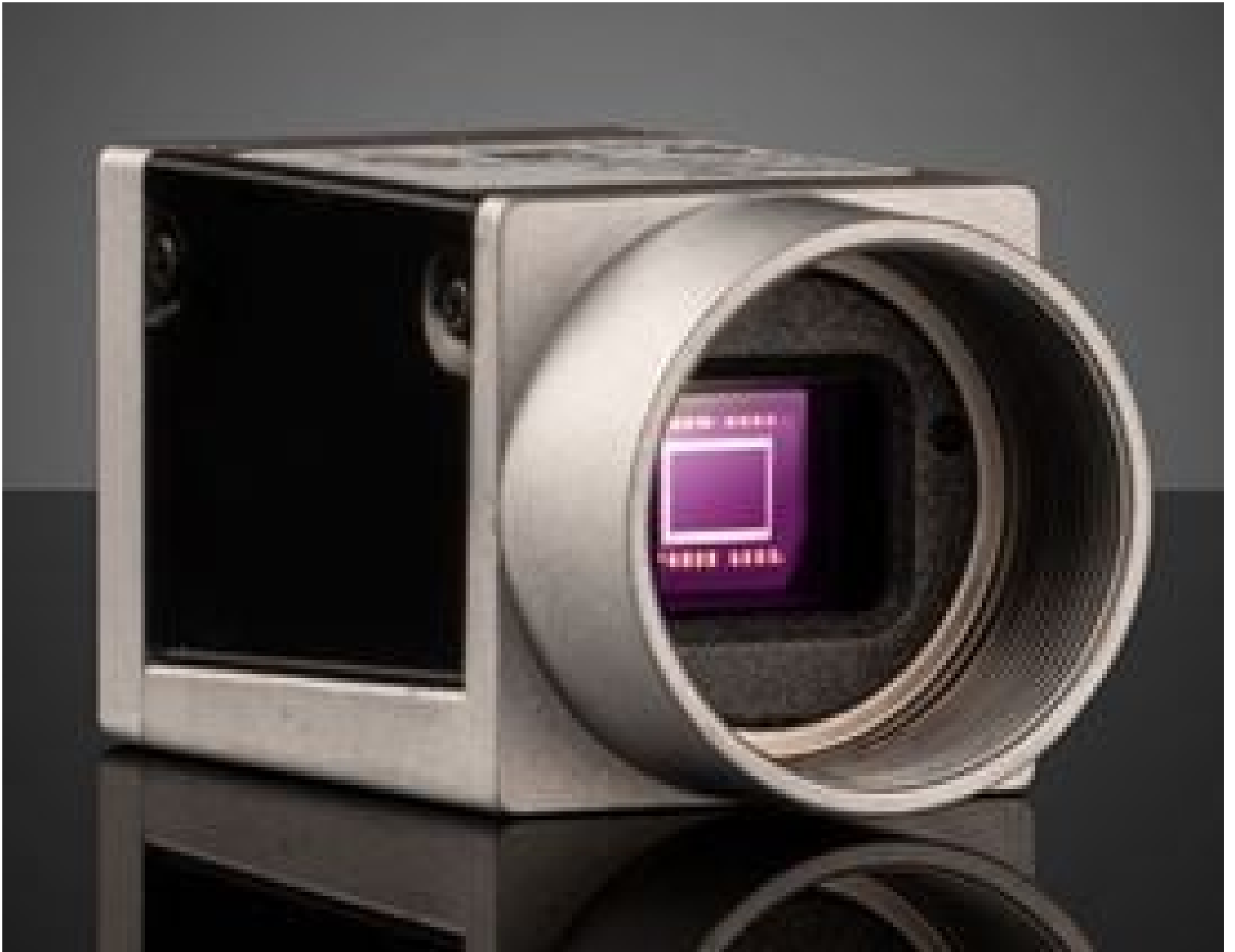
Basler ace GigE Cameras