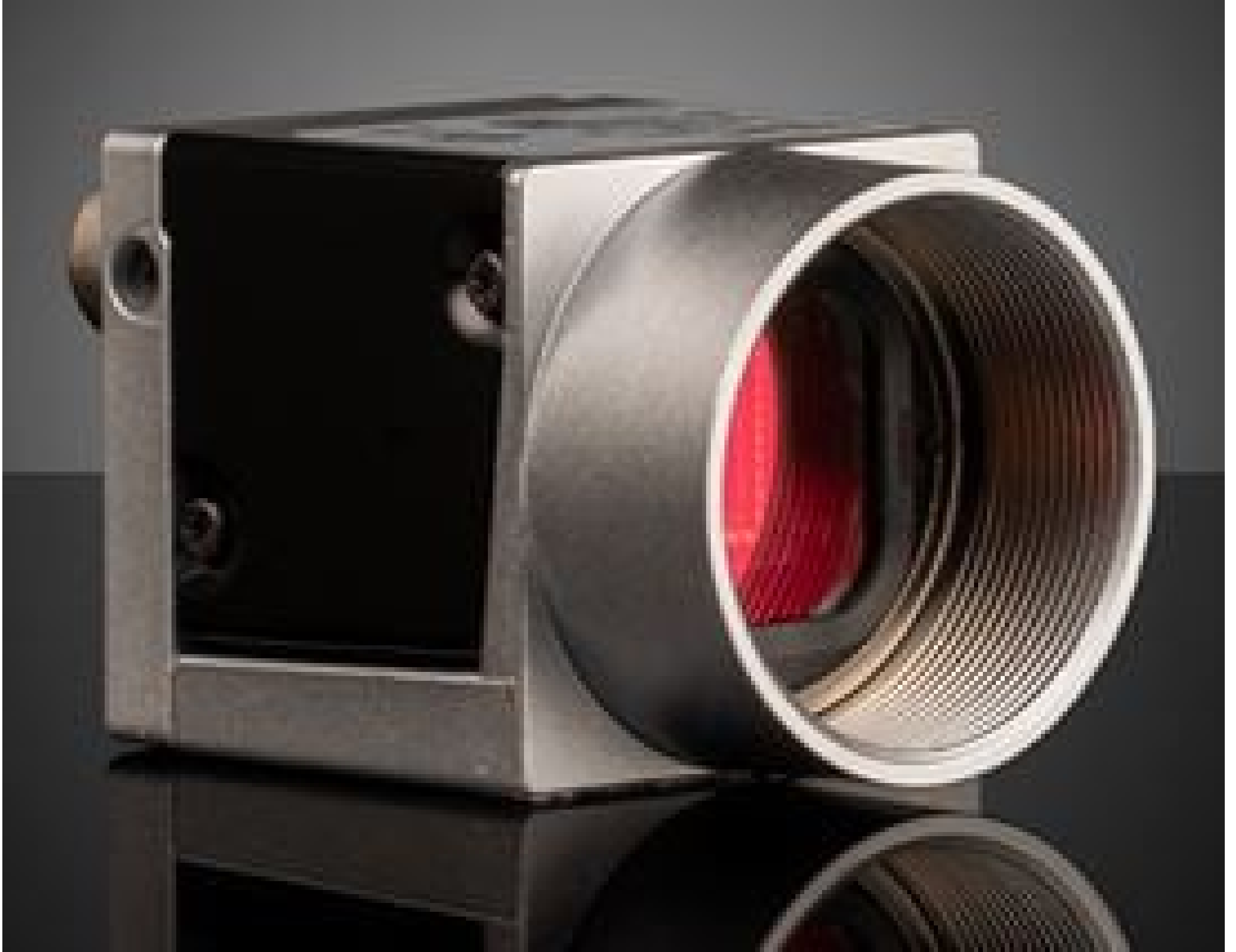
Basler ace USB 3.0 Cameras (Front)