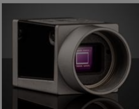
Basler ace GigE Cameras