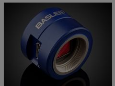
Basler PowerPack Microscopy Cameras