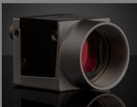
Basler ace USB 3.0 Cameras