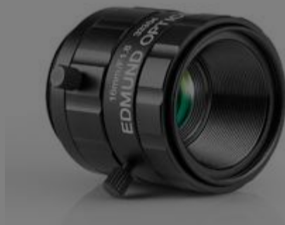
#33-304 - 16mm UC Series Fixed Focal Length Lens €260,00