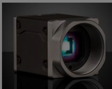
Basler ace2 USB 3.0 Cameras