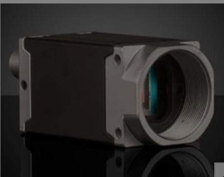
Basler ace2 GigE Cameras (Front)