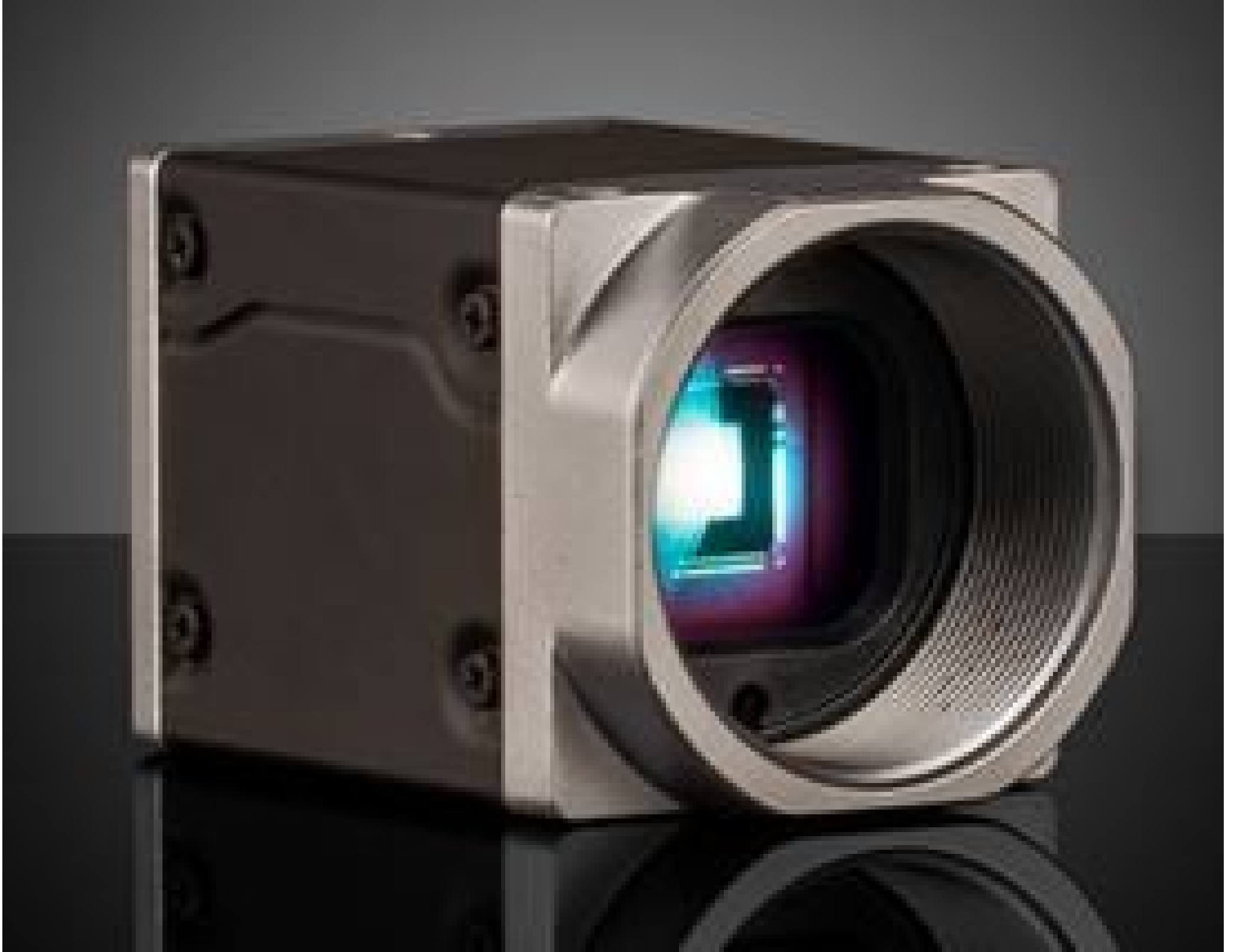
Basler ace2 USB 3.0 Cameras (Front)