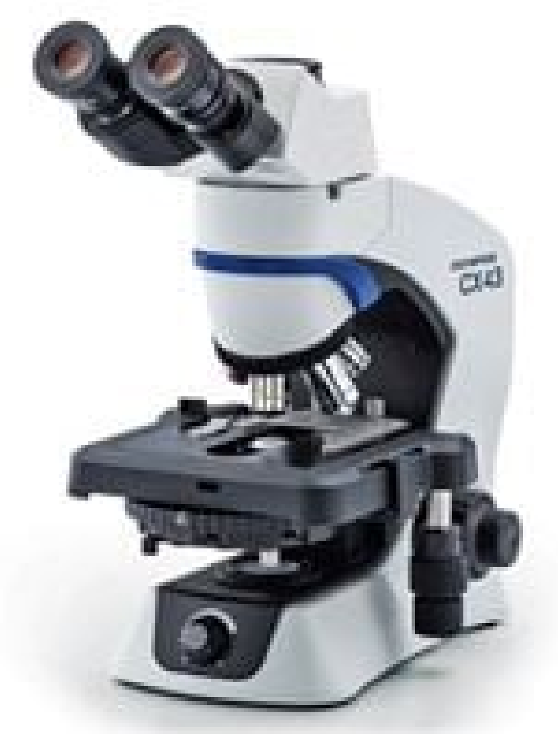
Image shown is full assembly. Each component sold separately. See Technical Information tab for additional details.