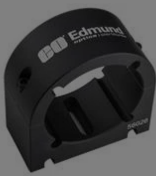
#56-026 - Mounting Clamp, 79mm Inner Diameter €251,00