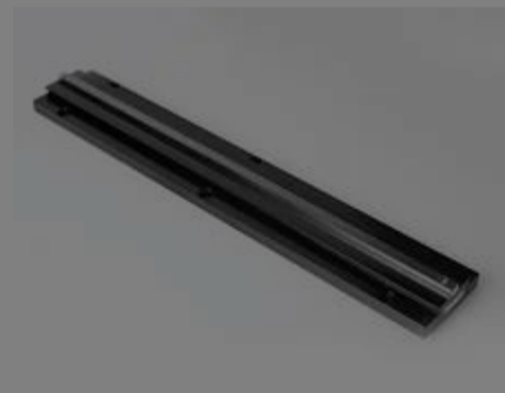
#56-797 - 550mm Travel Metric Long Travel Rack & Pinion Track €449,00