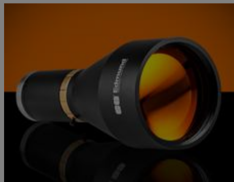
#34-005 - 0.184X, 2/3" C-Mount TitanTL® Telecentric Lens €1.750,00