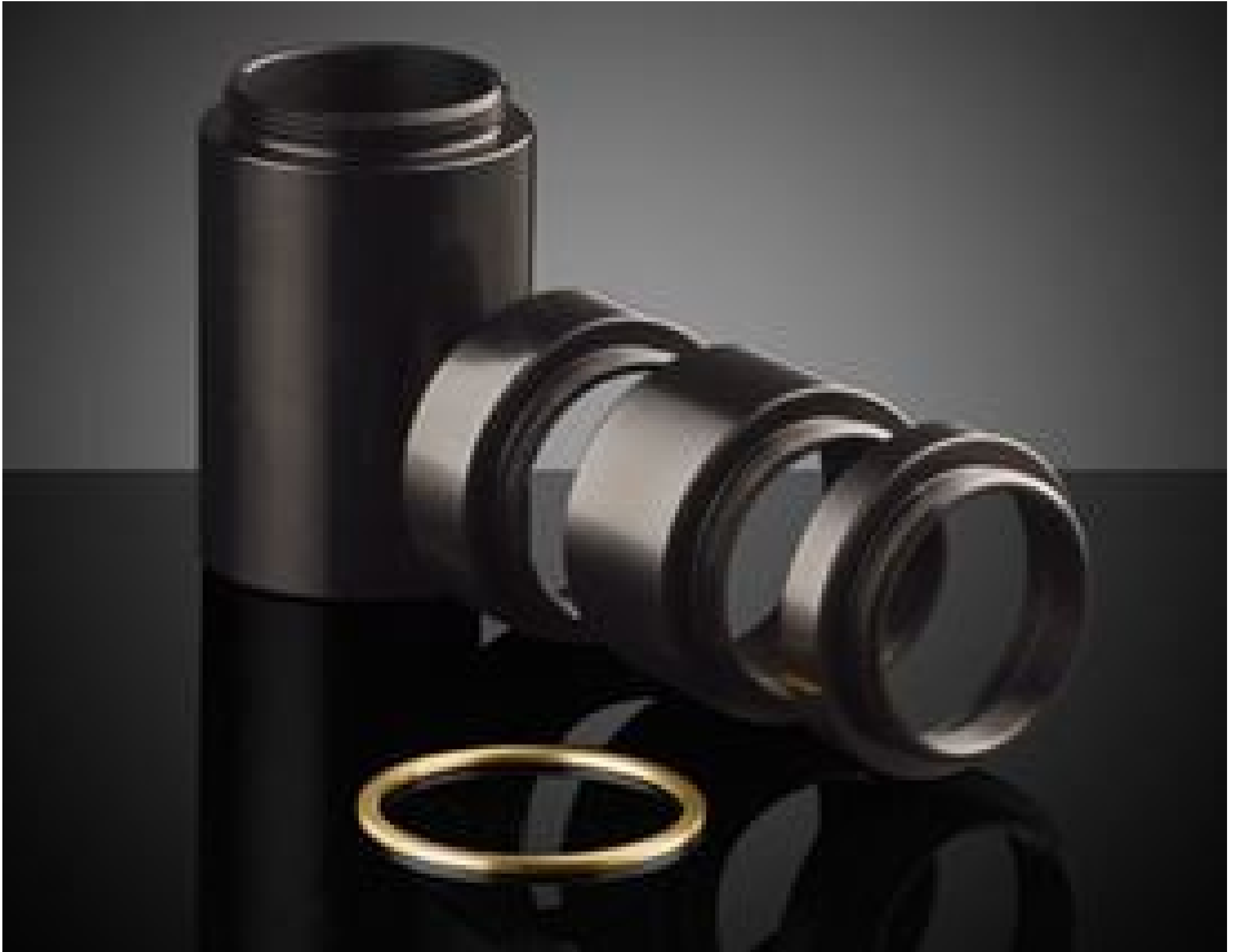
C-Mount Extension Tube Kit, #54-261