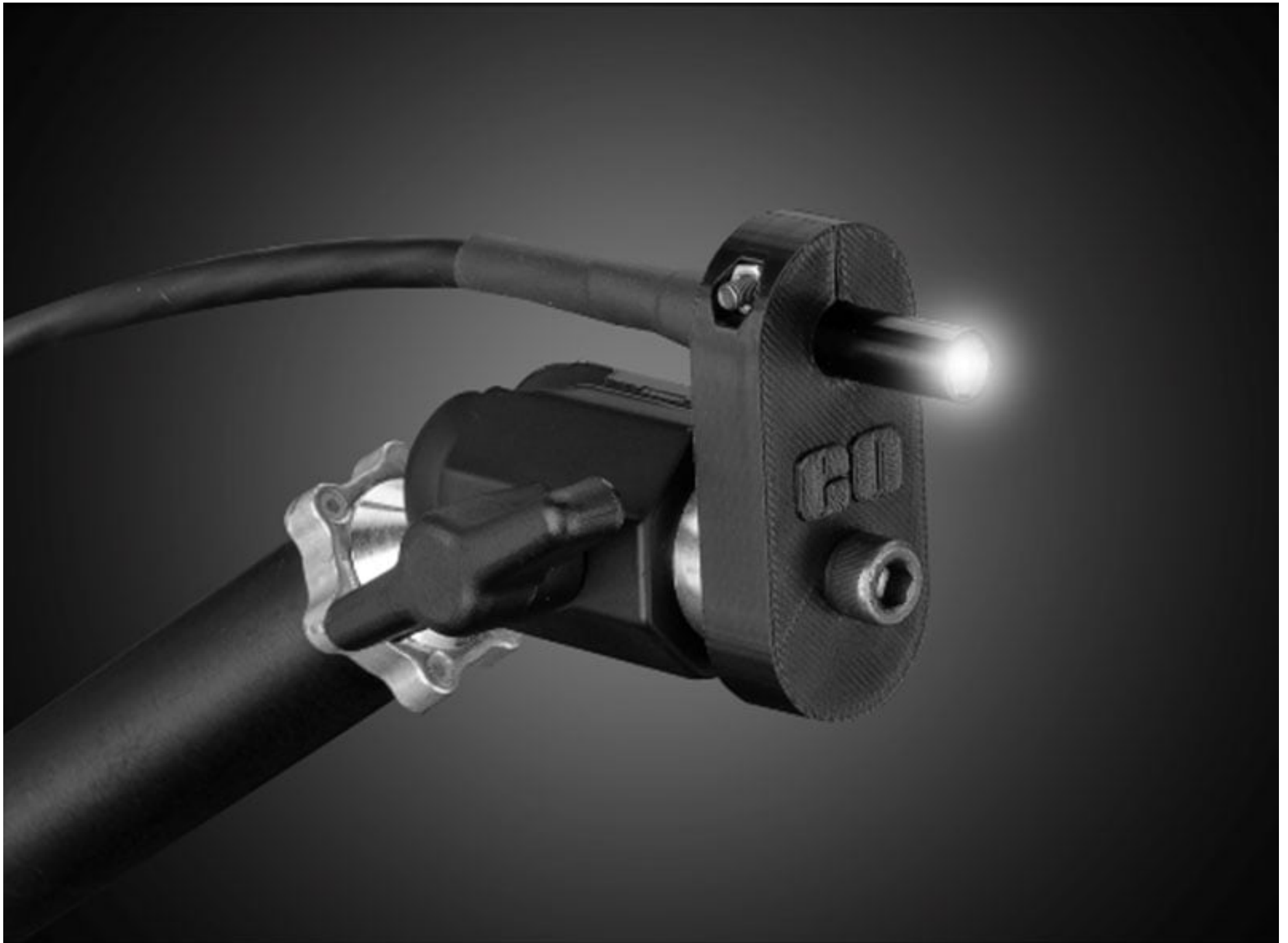
Spot Light Configuration