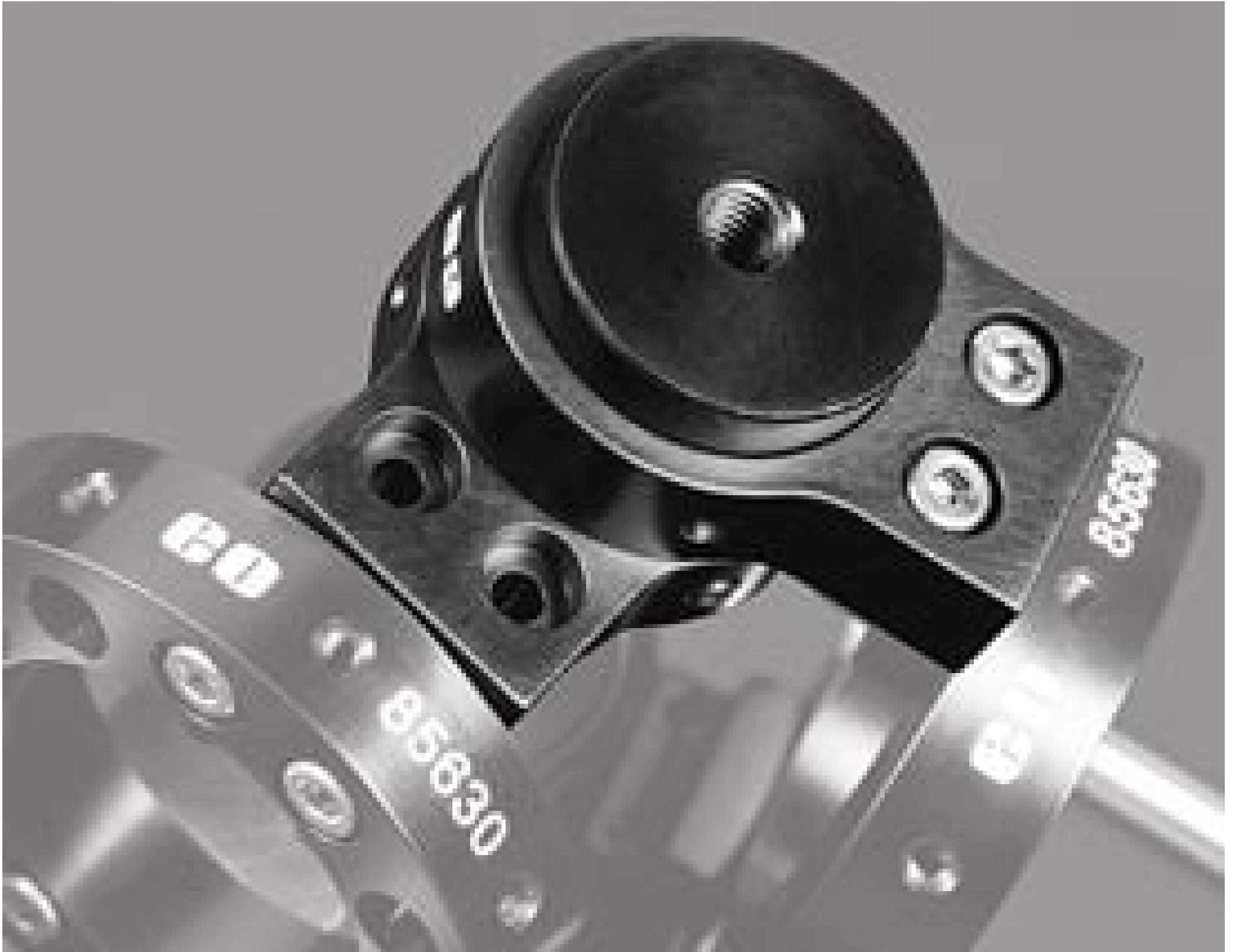
TECHSPEC® Swivel Joint Add-On Kit