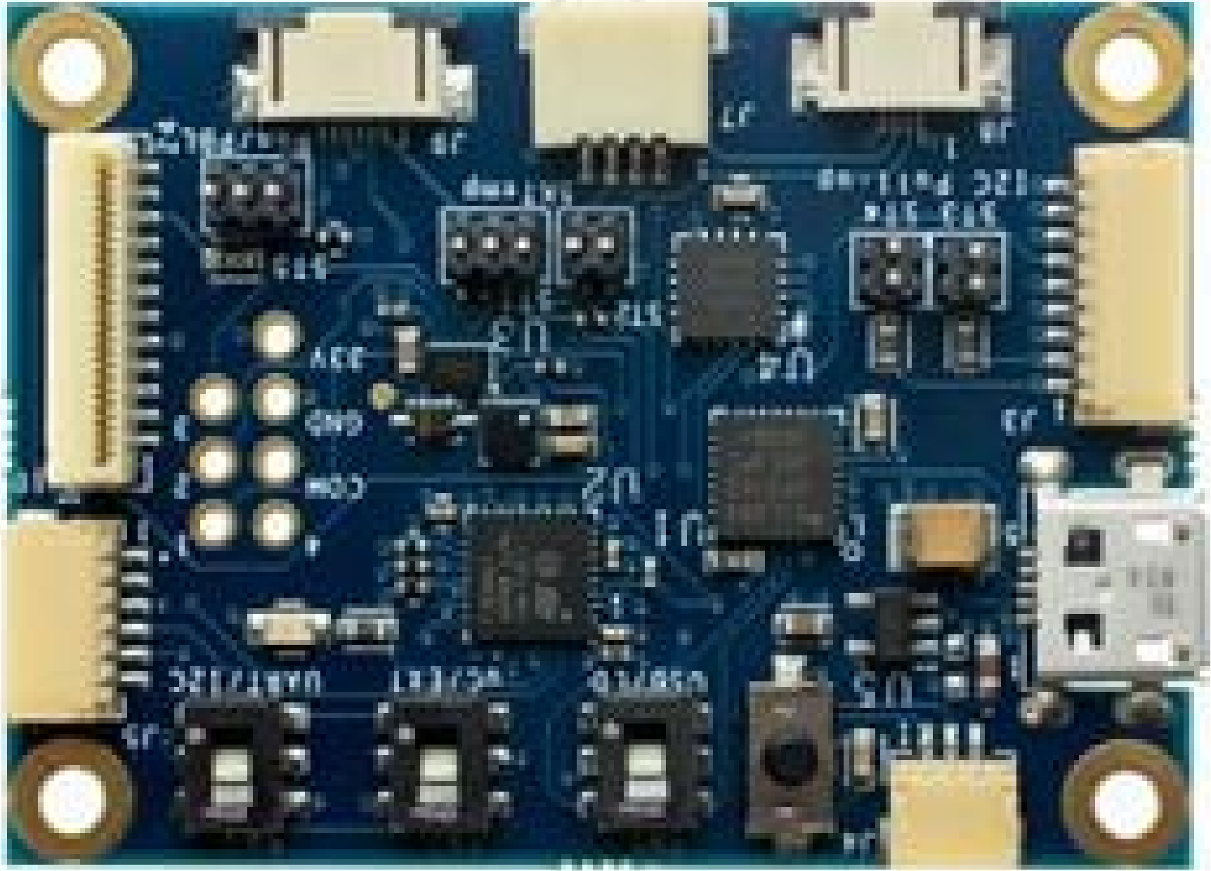
USB-MUniversal Driver Board