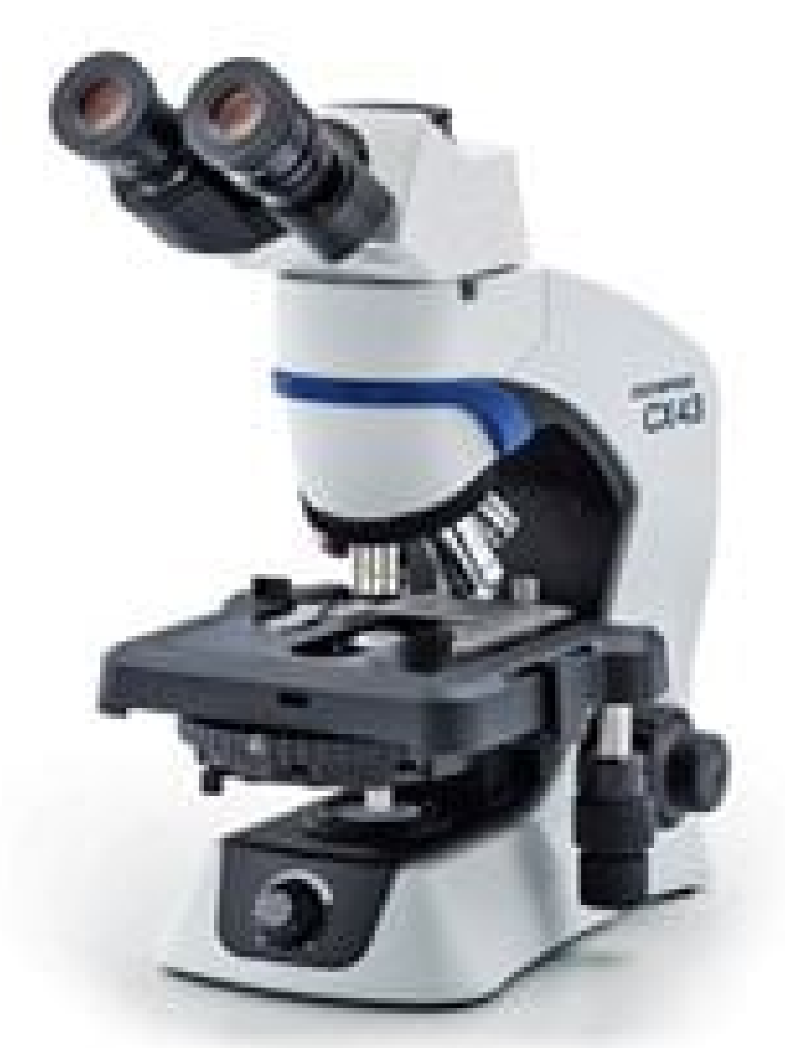
Image shown is full assembly. Each component sold separately. See Technical Information tab for additional details.