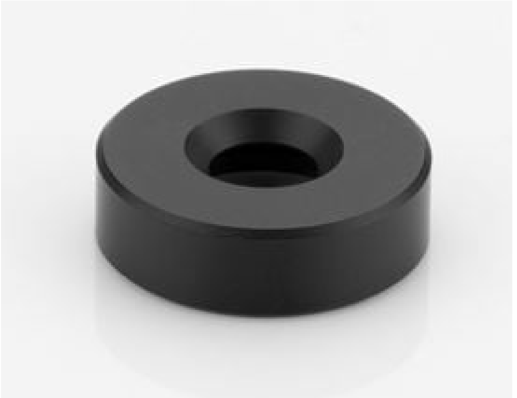
Filter Holder for 50mm Cx Lens (representative photo). Filter Holder varies by stock number. View PDF drawing for additional information.