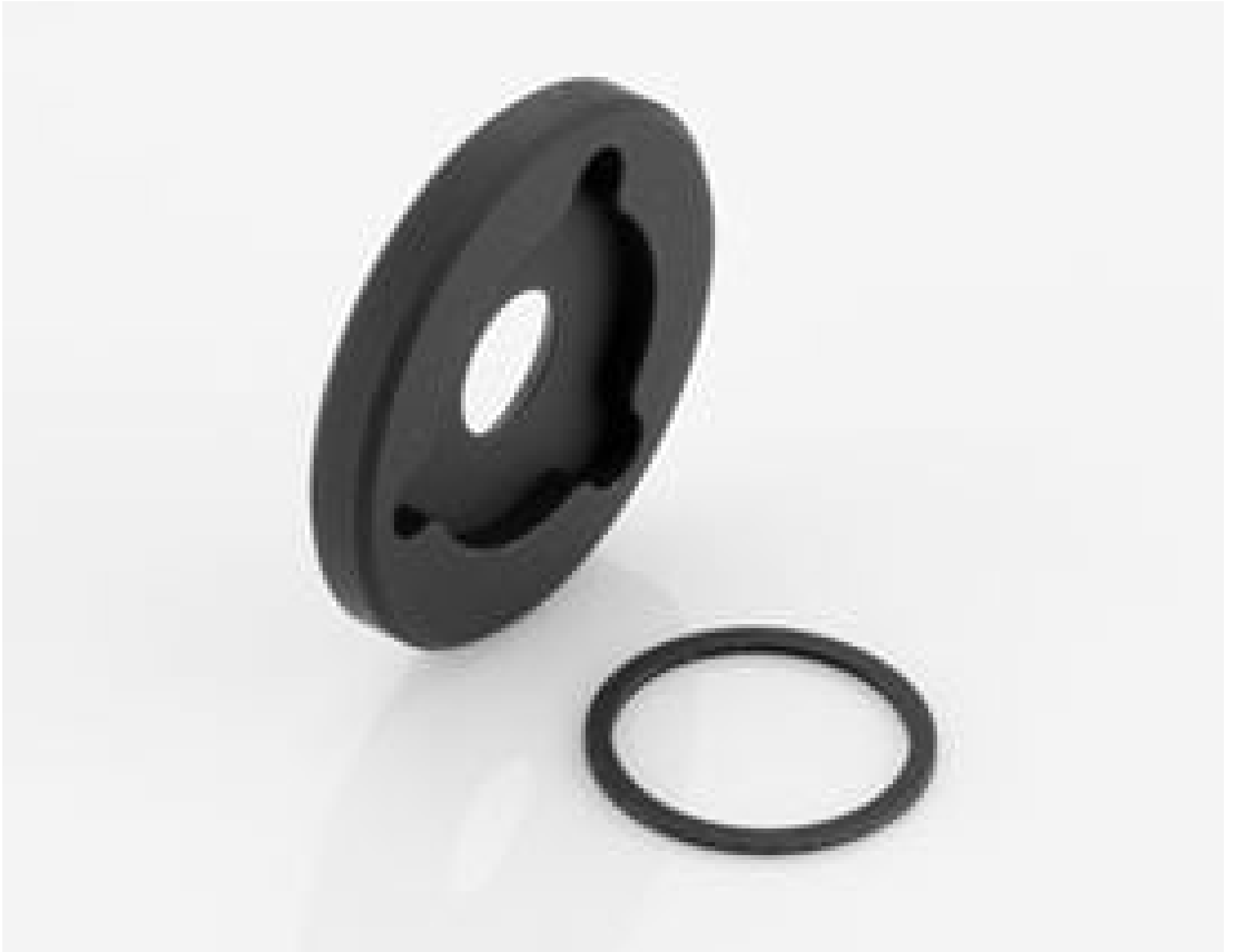
Filter Holder for Cx lens