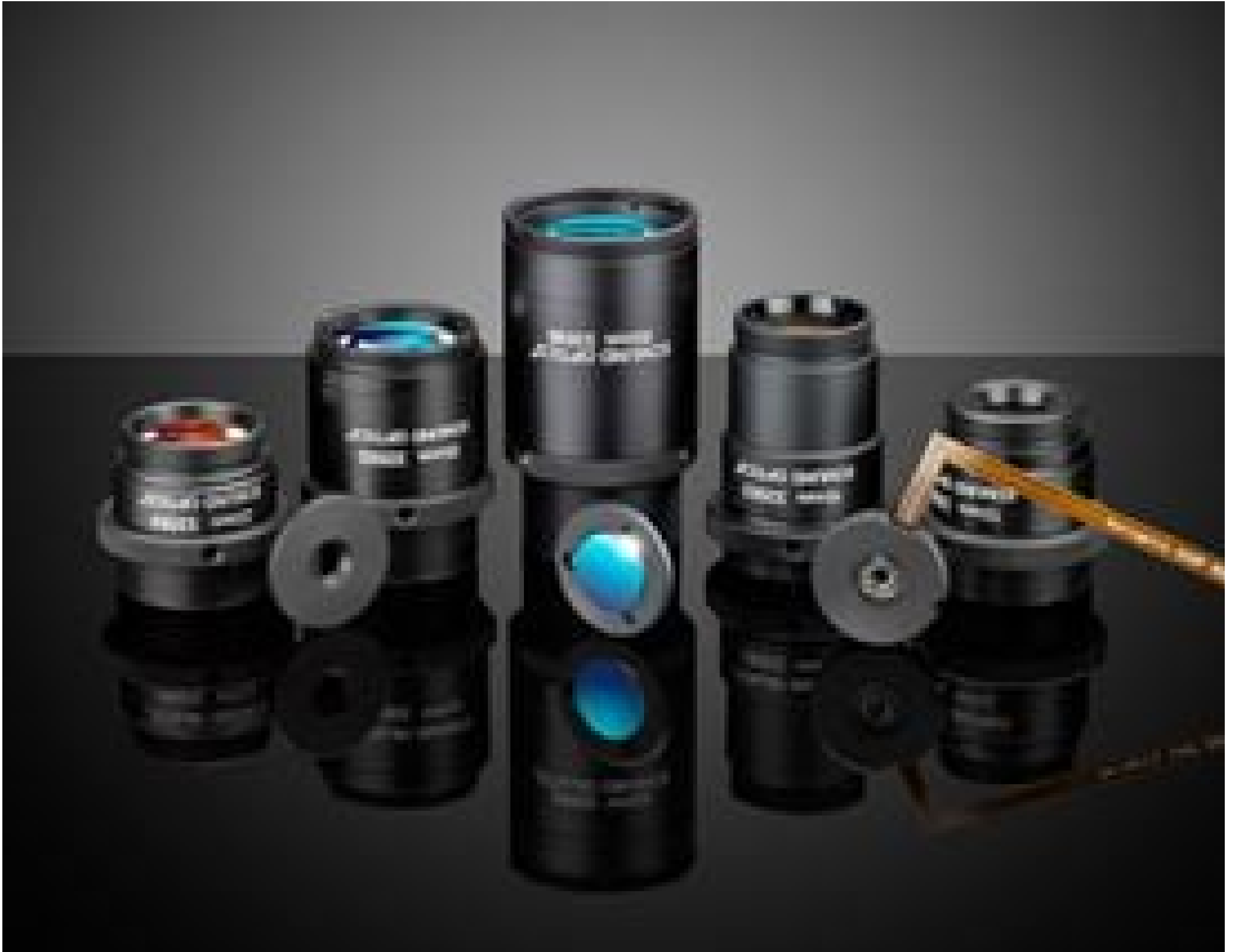
TECHSPEC® Cx Series Fixed Focal Length Lenses