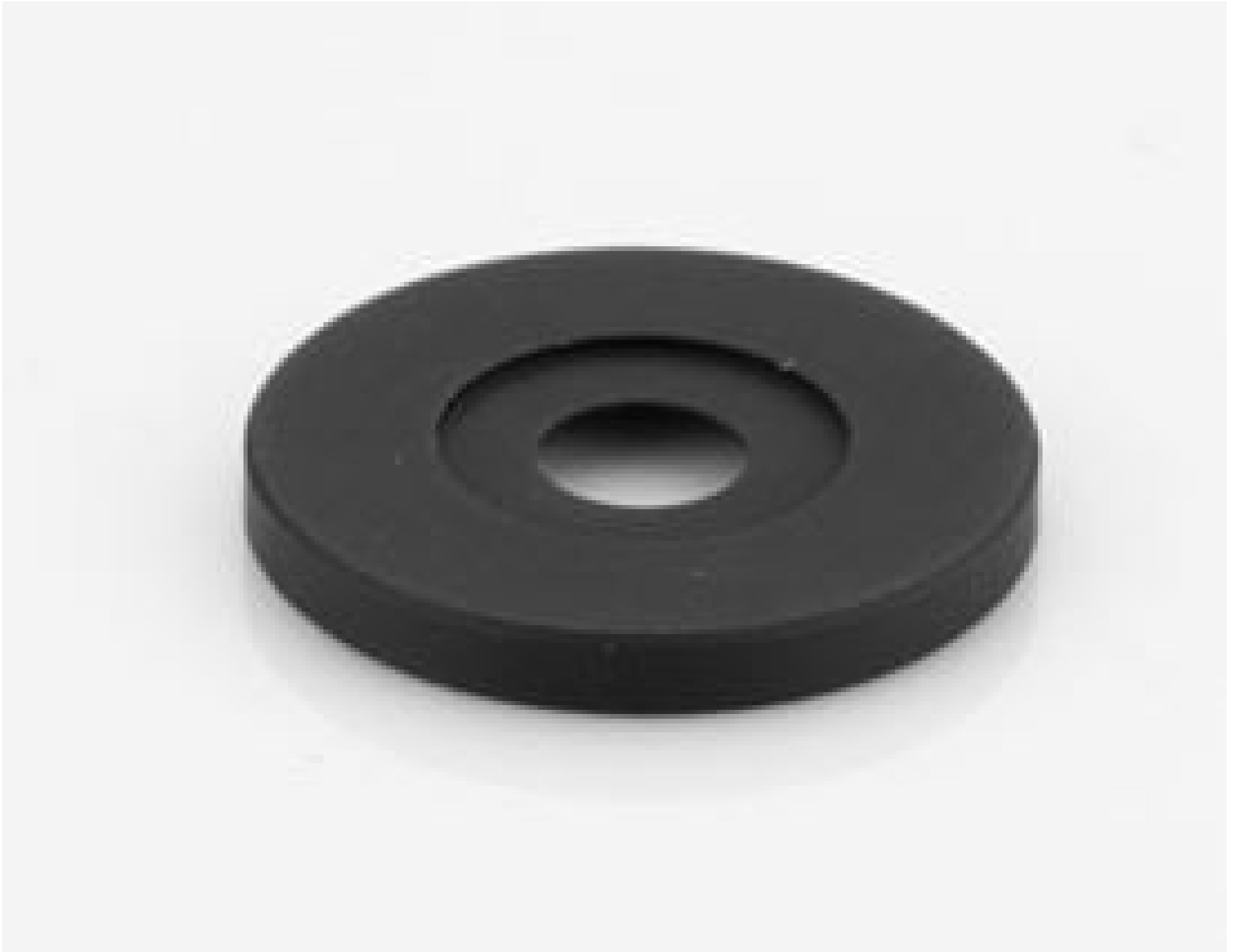
Aperture for Cx Lens (representative photo). Aperture varies by stock number. View PDF drawing for additional information.