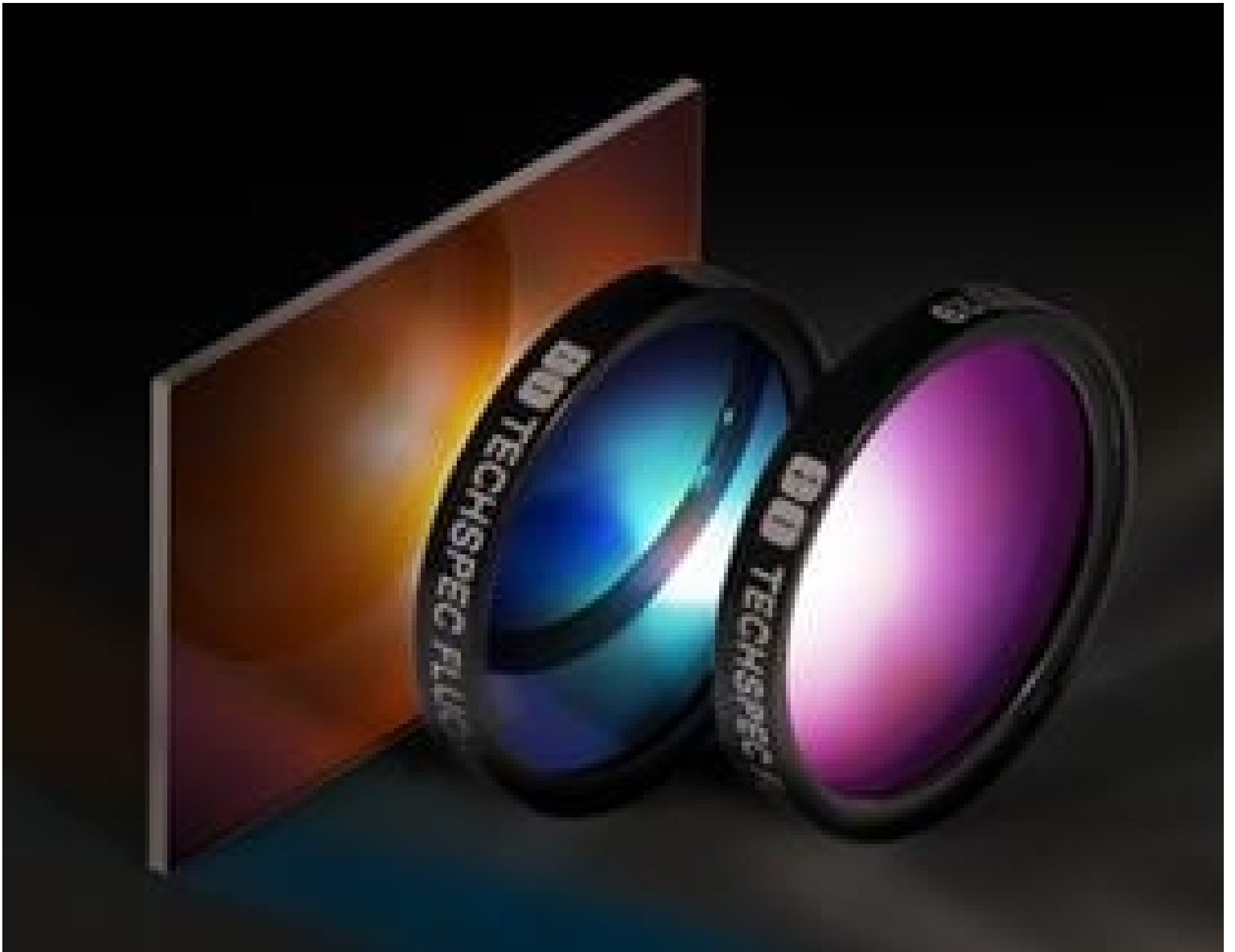
Fluorescence Filter Sets