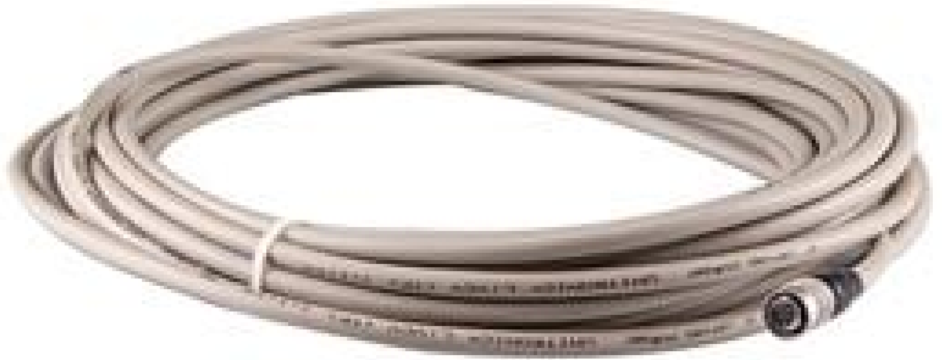
10m GPIO & Power Cable, #88-516