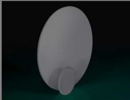
#34-480 - 100 x 100mm White Diffusing Glass €66,00