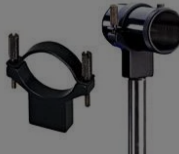
#38-513 - 30mm Inner Diameter, Ring Mount €60,50