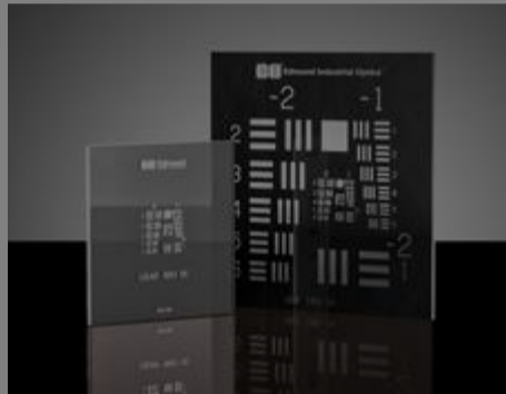
#36-275 - 3" x 3" Positive, USAF 1951 Resolution Target €297,00