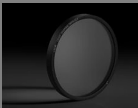
#48-506 - 10° Diffusing Angle 25mm Dia., Fused Silica Holographic Diffuser €499,00