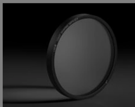
#48-509 - 25° Diffusing Angle 25mm Dia., Fused Silica Holographic Diffuser €499,00