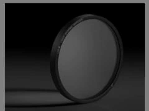
#48-513 - 0.5° Diffusing Angle 50mm Dia., Fused Silica Holographic Diffuser €820,00