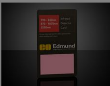
#55-292 - Laser Detection Card IR €108,00