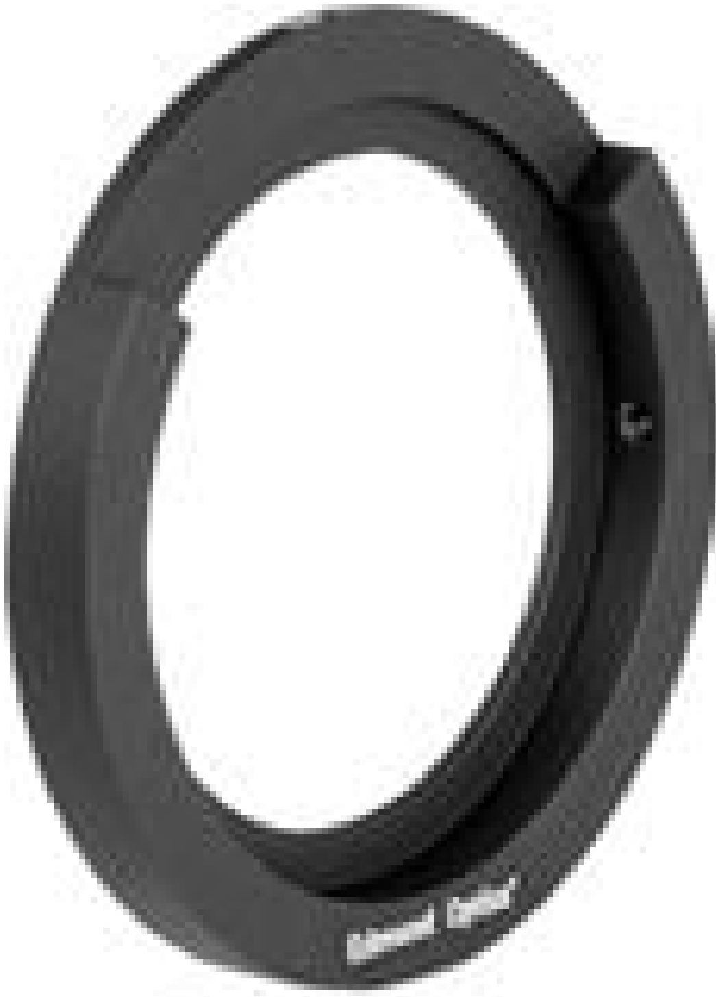
Iris Mount for 70mm Outer Diameter Irises, #53-921