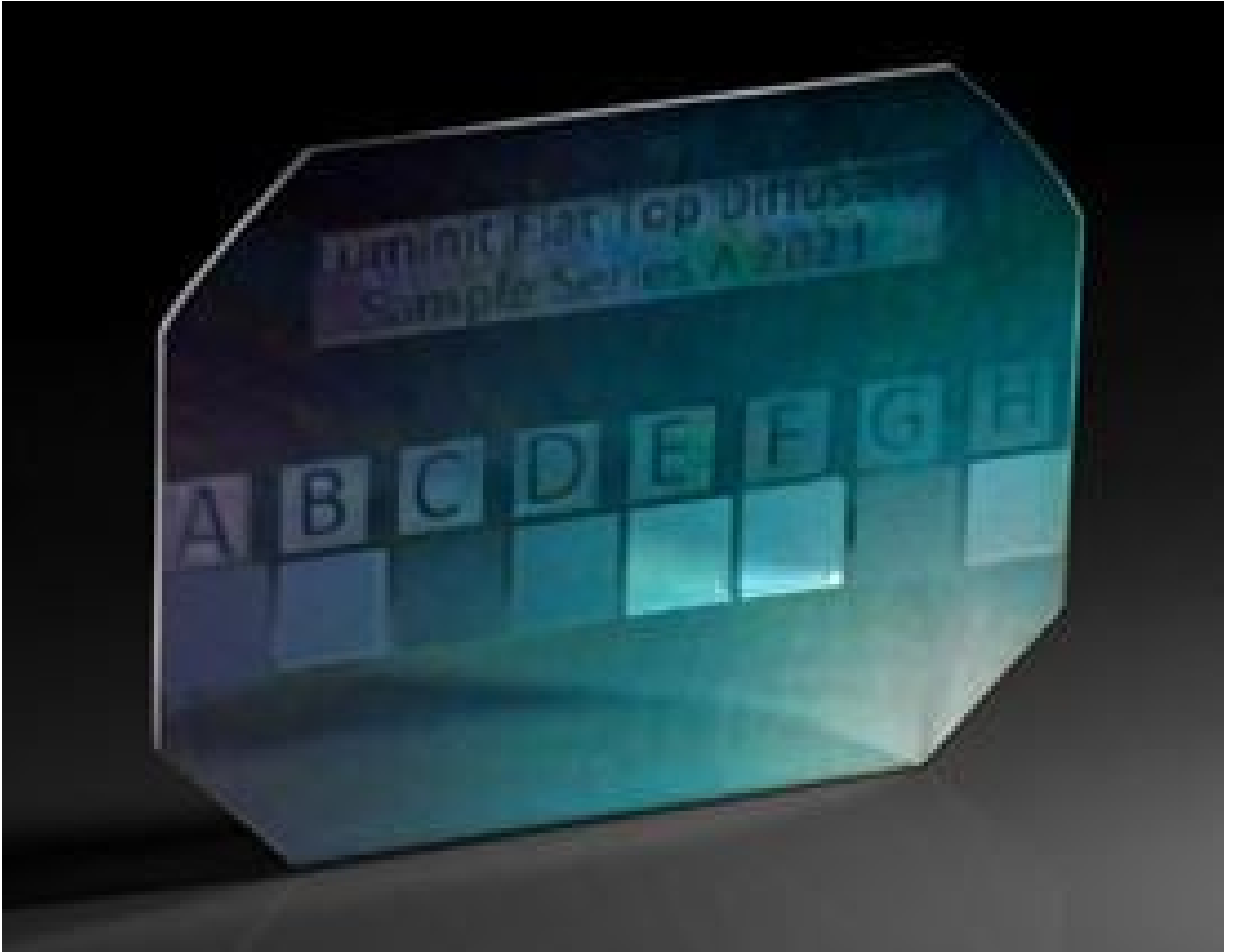
Flat Top Holographic Diffuser Sets