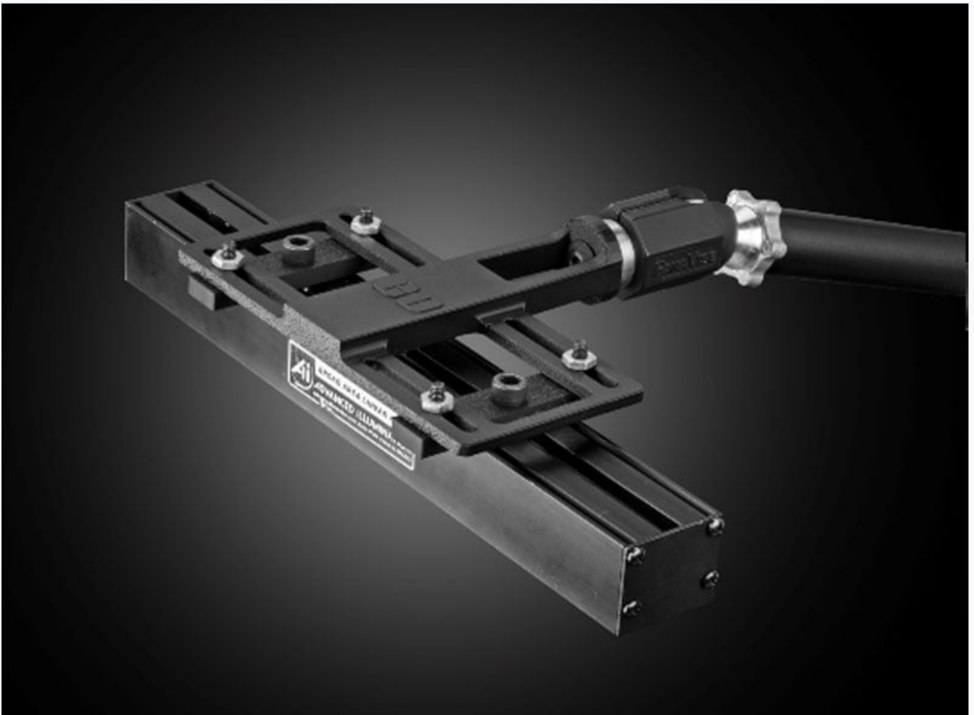
Bar or Line Light Configuration