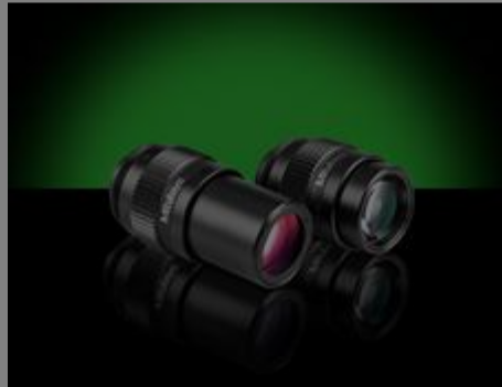
#56-985 - 3X Mitutoyo Telecentric Objective €1.465,00