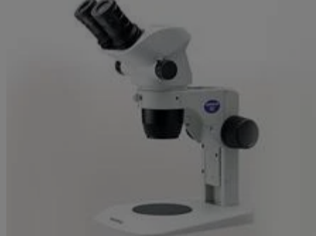
Olympus SZ51 and SZ61 Zoom Stereo Microscopes