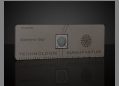
High Resolution Microscopy Slide Targets