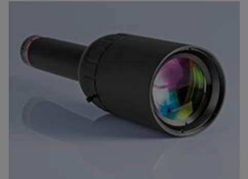
#58-432 - 4.0X SilverTL™ Telecentric Lens €1.390,00