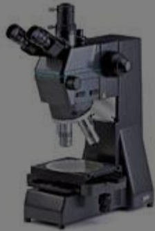
Mitutoyo FS70 Inspection Microscope