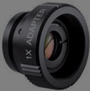
#54-428 - MT-4 Accessory Tube Lens €865,00