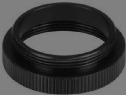
#03-618 - 5mm Spacer to convert CS-Mount Cameras to C-Mount €29,00