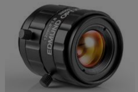
#33-303 - 12mm UC Series Fixed Focal Length Lens €260,00