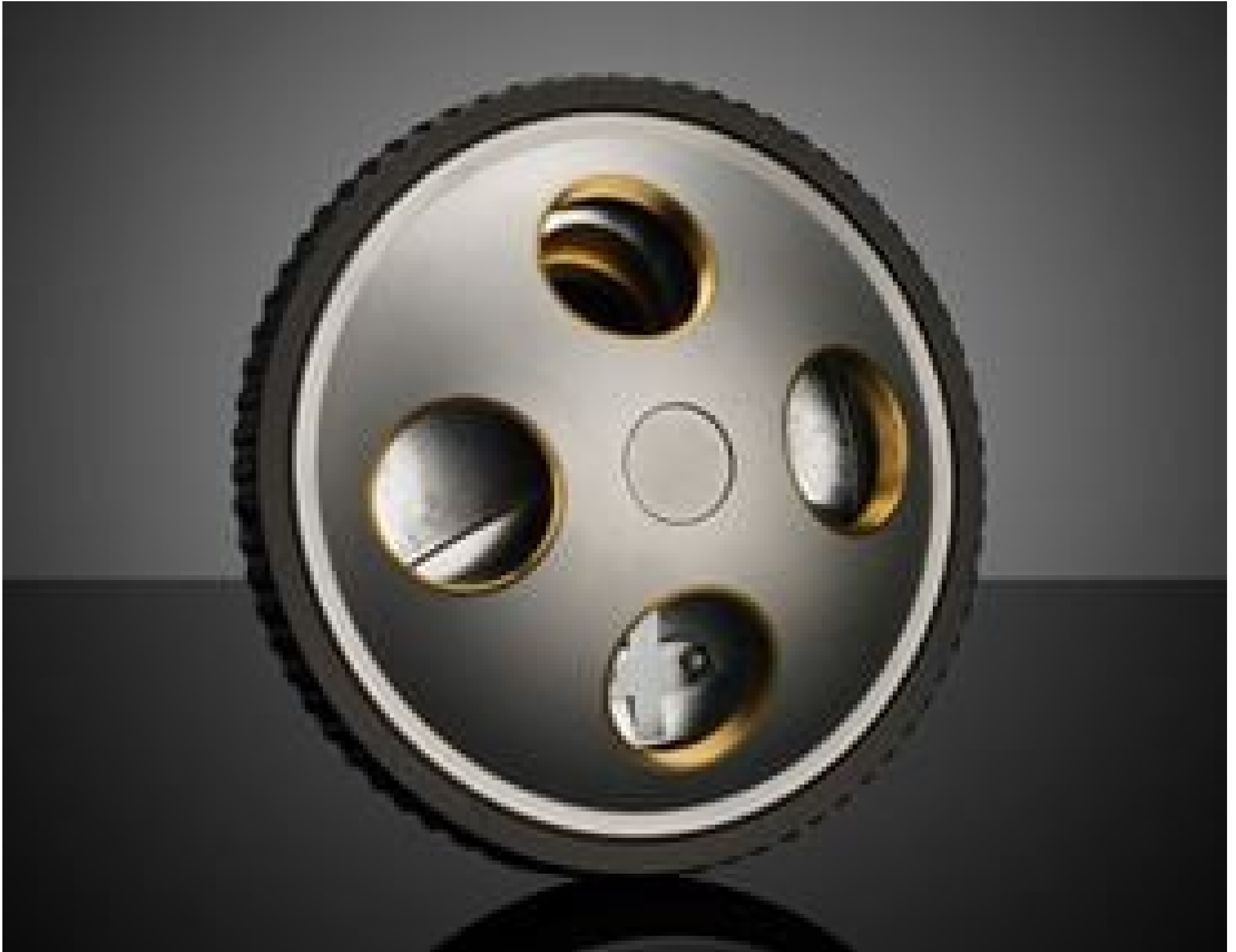
C-Mount Manual Objective Turrets