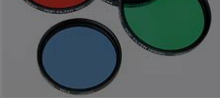
#46-547 - Mounted M30.5 x 0.5 Threaded - Blue Filter €64,50