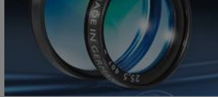
#49-810 - M37 x 0.75 Mounted UV/IR Cut-Off Filter €228,00