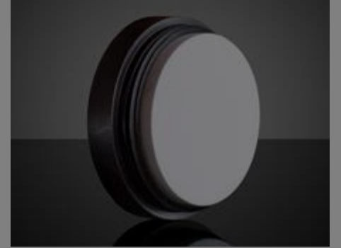
#54-302 - Spectralon® White Diffuse Reflectance Standard (99%) €595,00