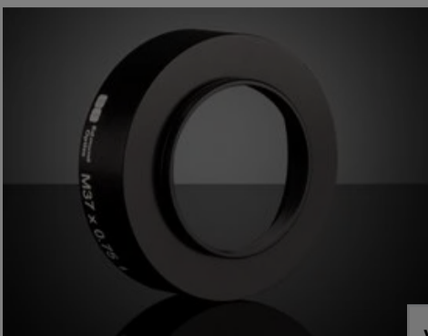
M37 x 0.75 Mount for 50/50.8mm Diameter Filters, #12-786

Please select your shipping country to view the most accurate inventory information, and to determine the correct Edmund Optics sales office for your order.