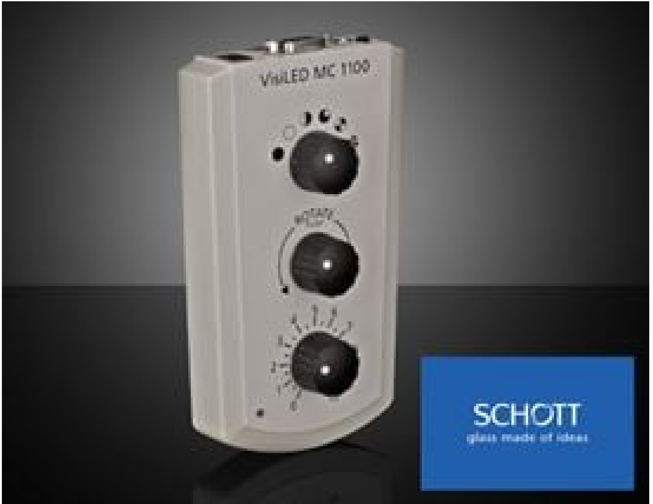
MC 1100, Multifunction Controller, #16-790