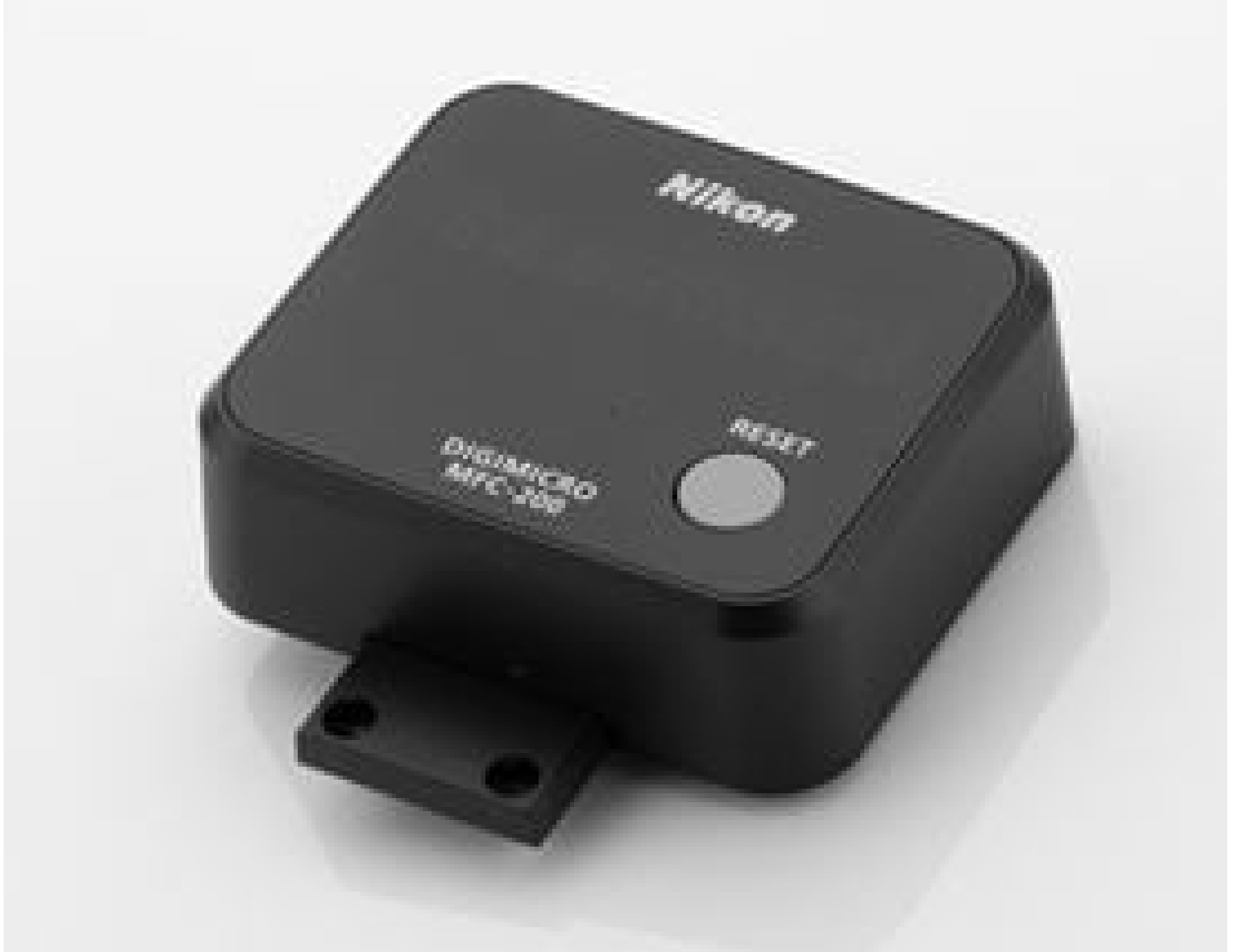
MFC-200 Compact Digital Counter