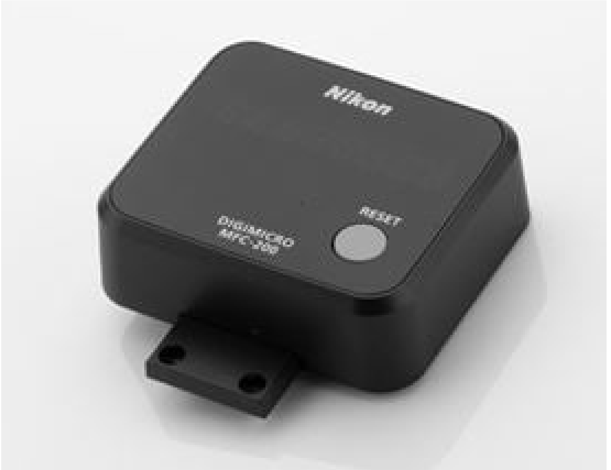
MFC-200 Compact Digital Counter