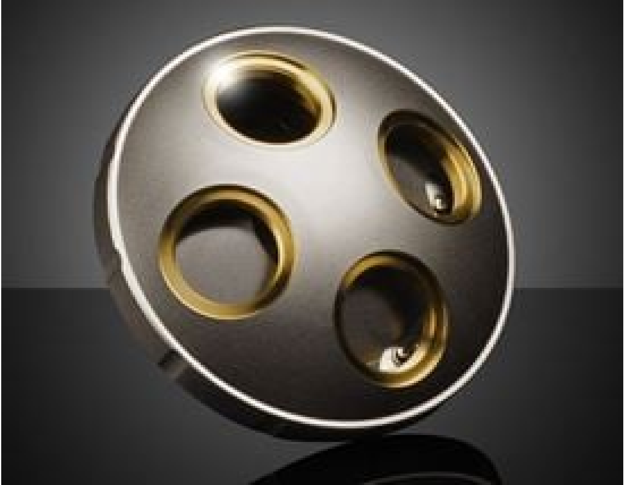
Mitutoyo Manual Turret