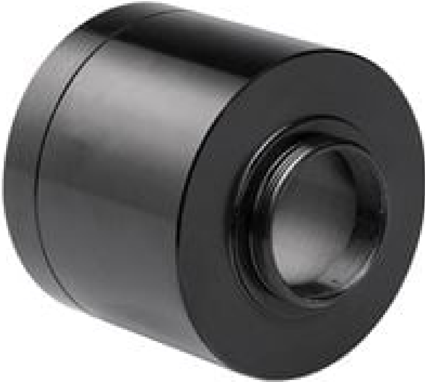
Mitutoyo MT-1/MT-2 C-mount Adapter, #58-329