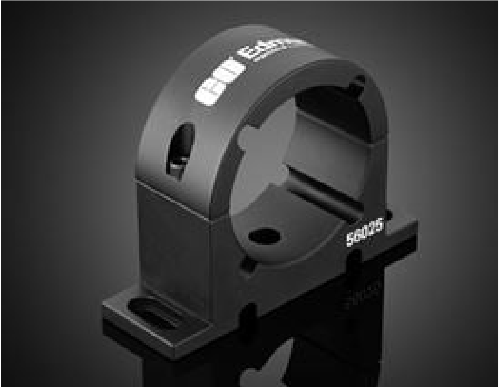
#56-025: Mounting Clamp, 65mm Inner Diameter