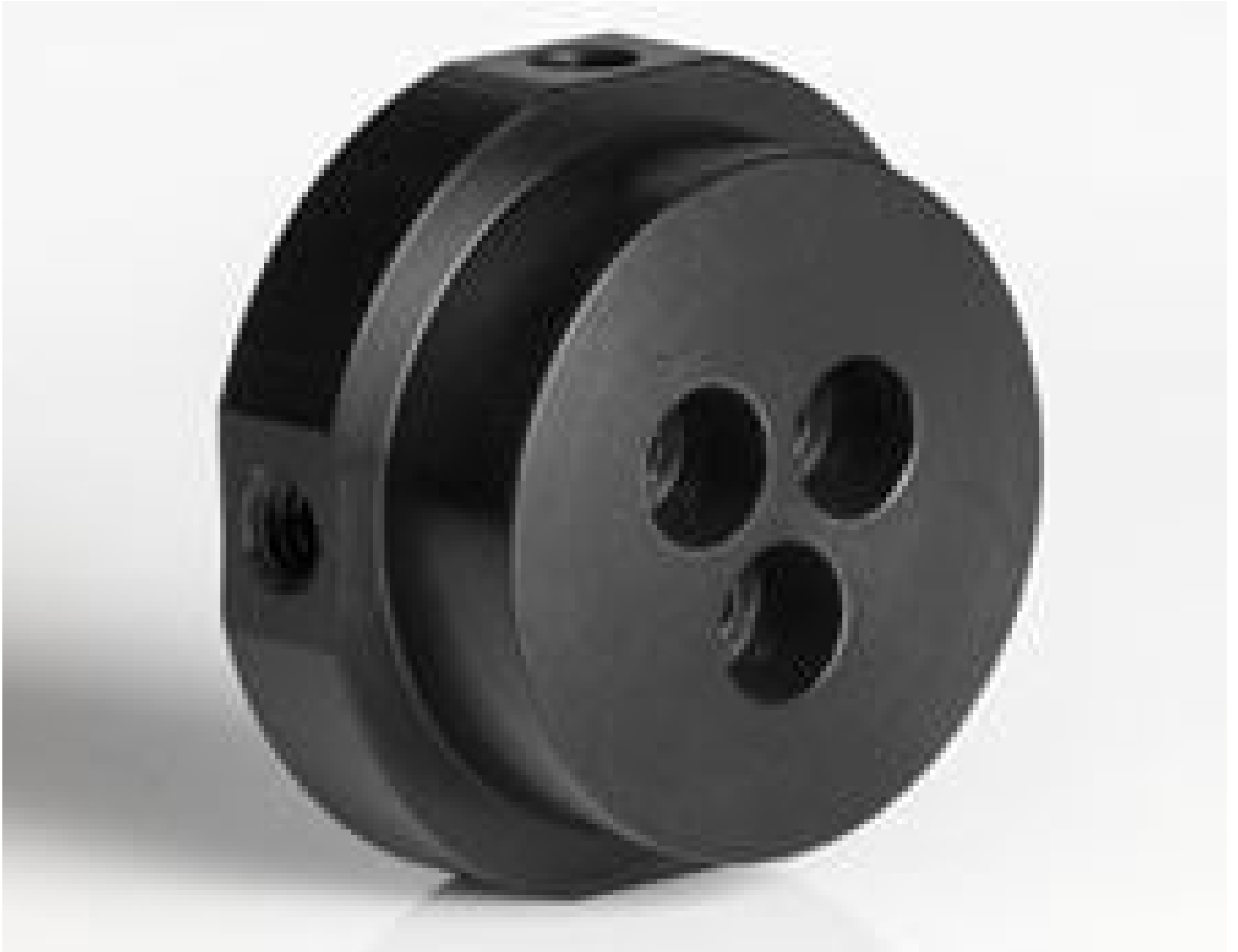
Mounting Plate for 12.7mm Diameter Off-Axis Mirrors, #34-425