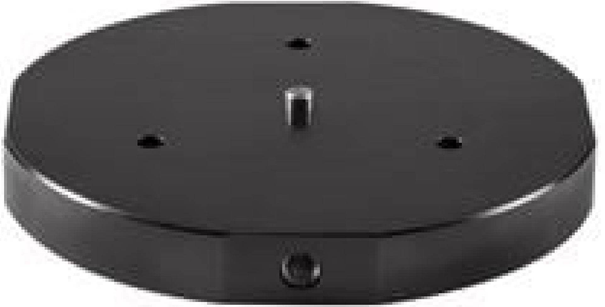
Mounting Plate for 50.8mm Diameter Off-Axis Mirrors, #47-112