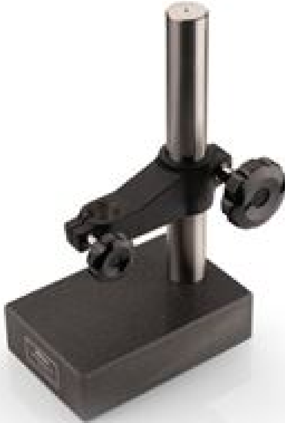
MS-32G Granite Measurement Stand